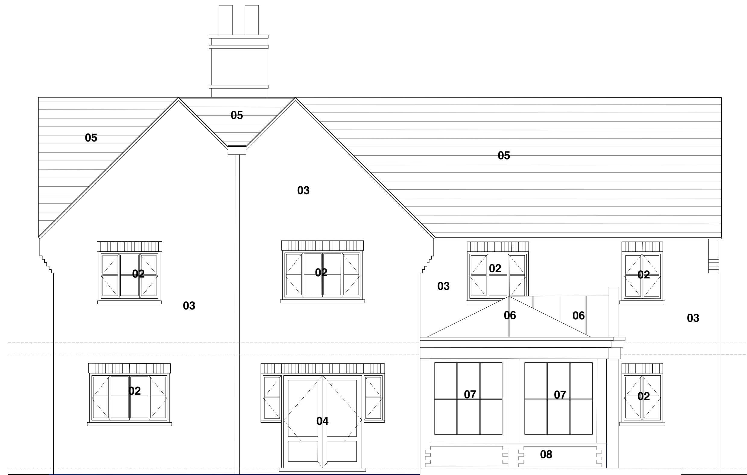
1 REAR ELEVATION 1:50