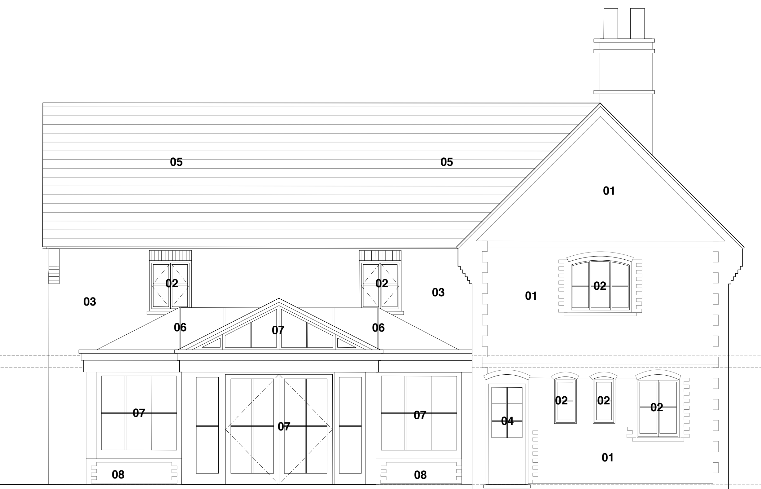
2 SIDE ELEVATION 1:50