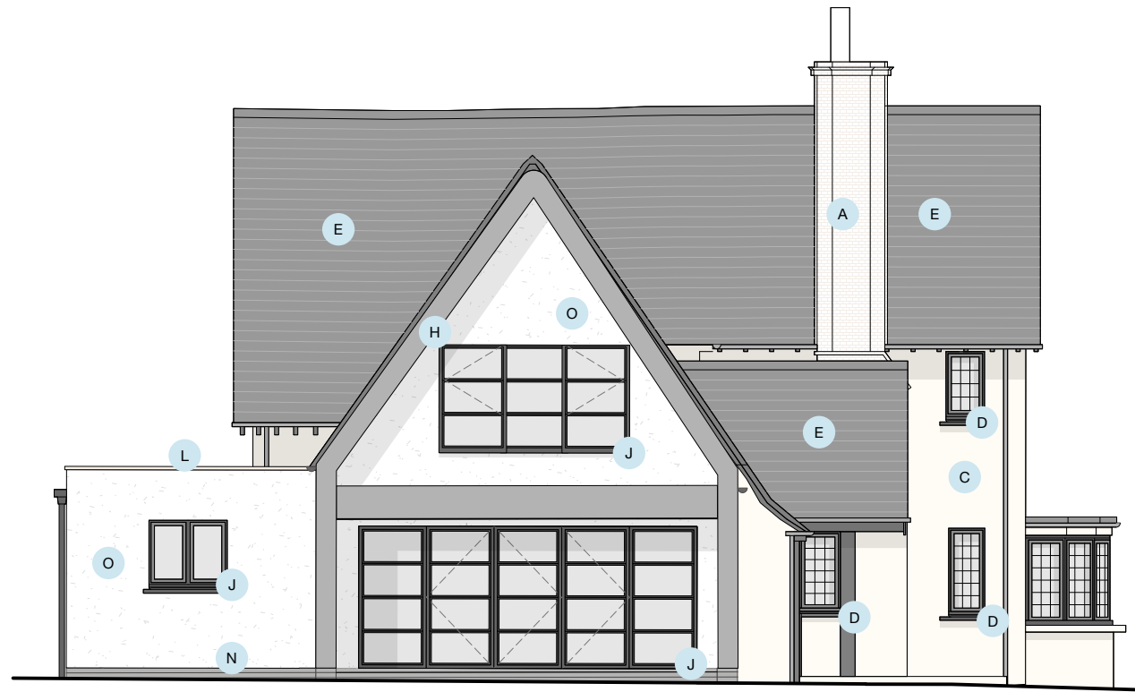
PROPOSED REAR/NORTH-WEST ELEVATION