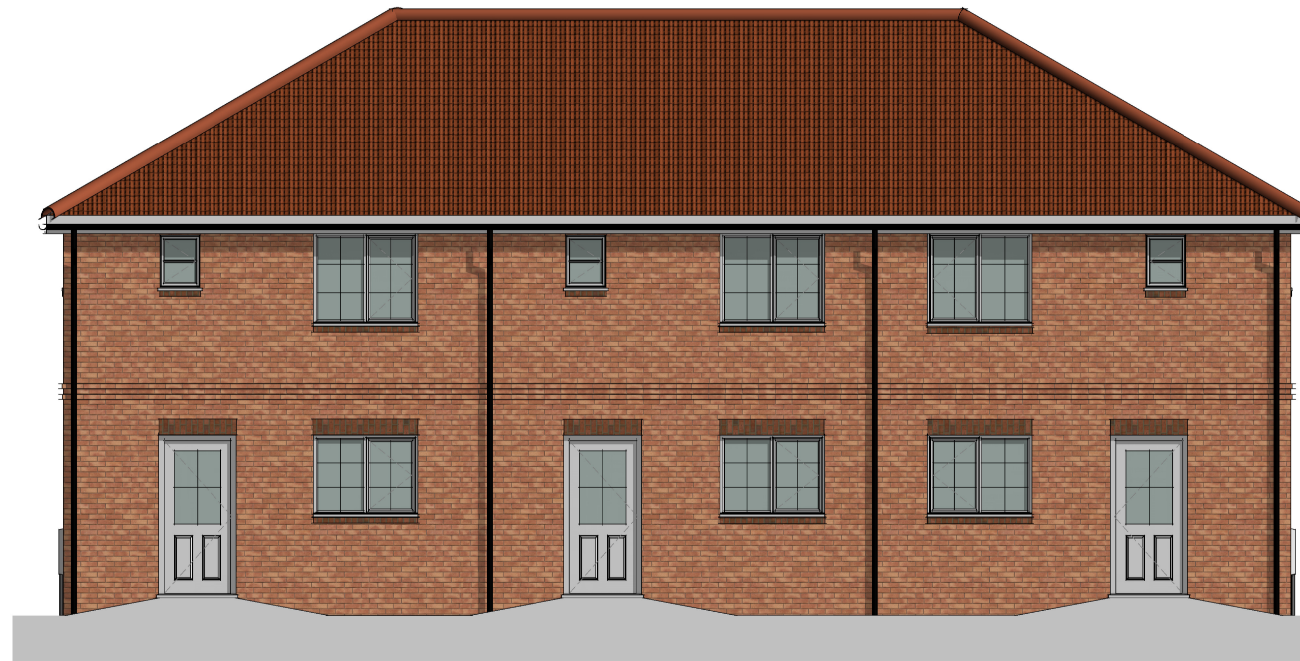
4 Rear Elevation 1 : 50