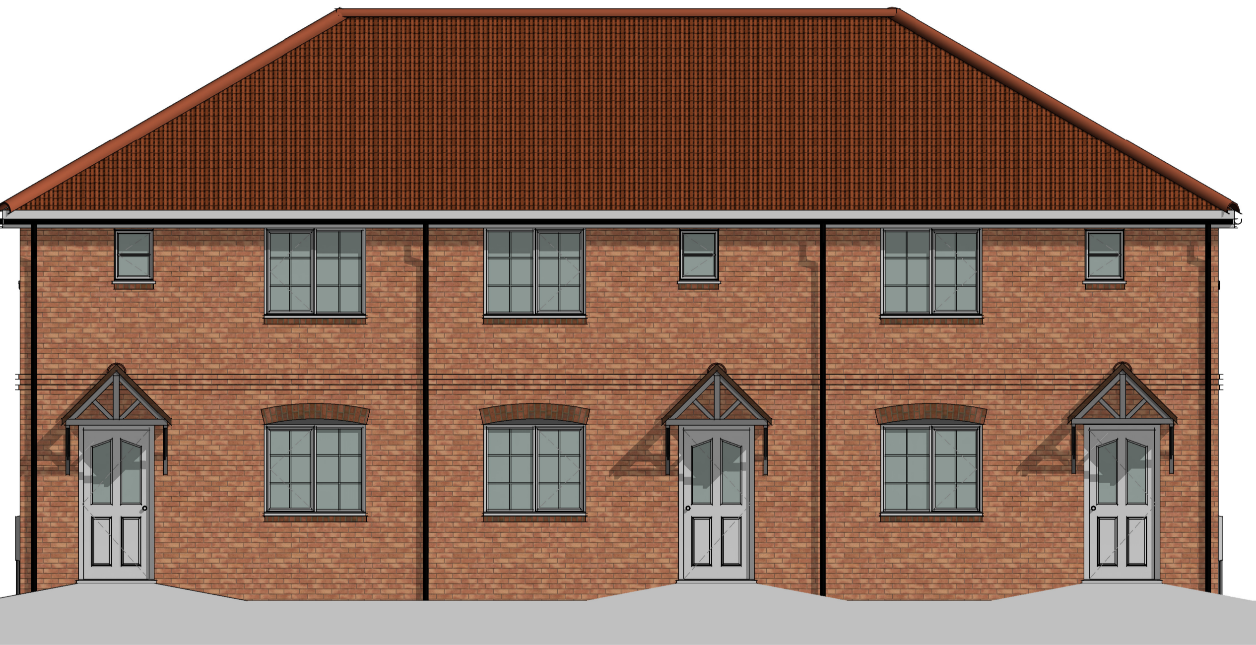
2 Front Elevation 1 : 50