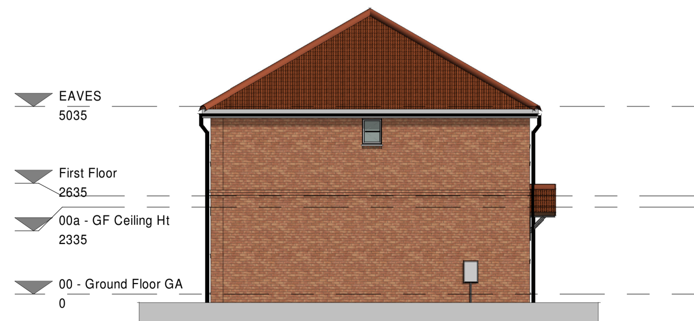
3 Side Elevation A 1 : 100

*= Refer to landscape drawing for specific plot brick type