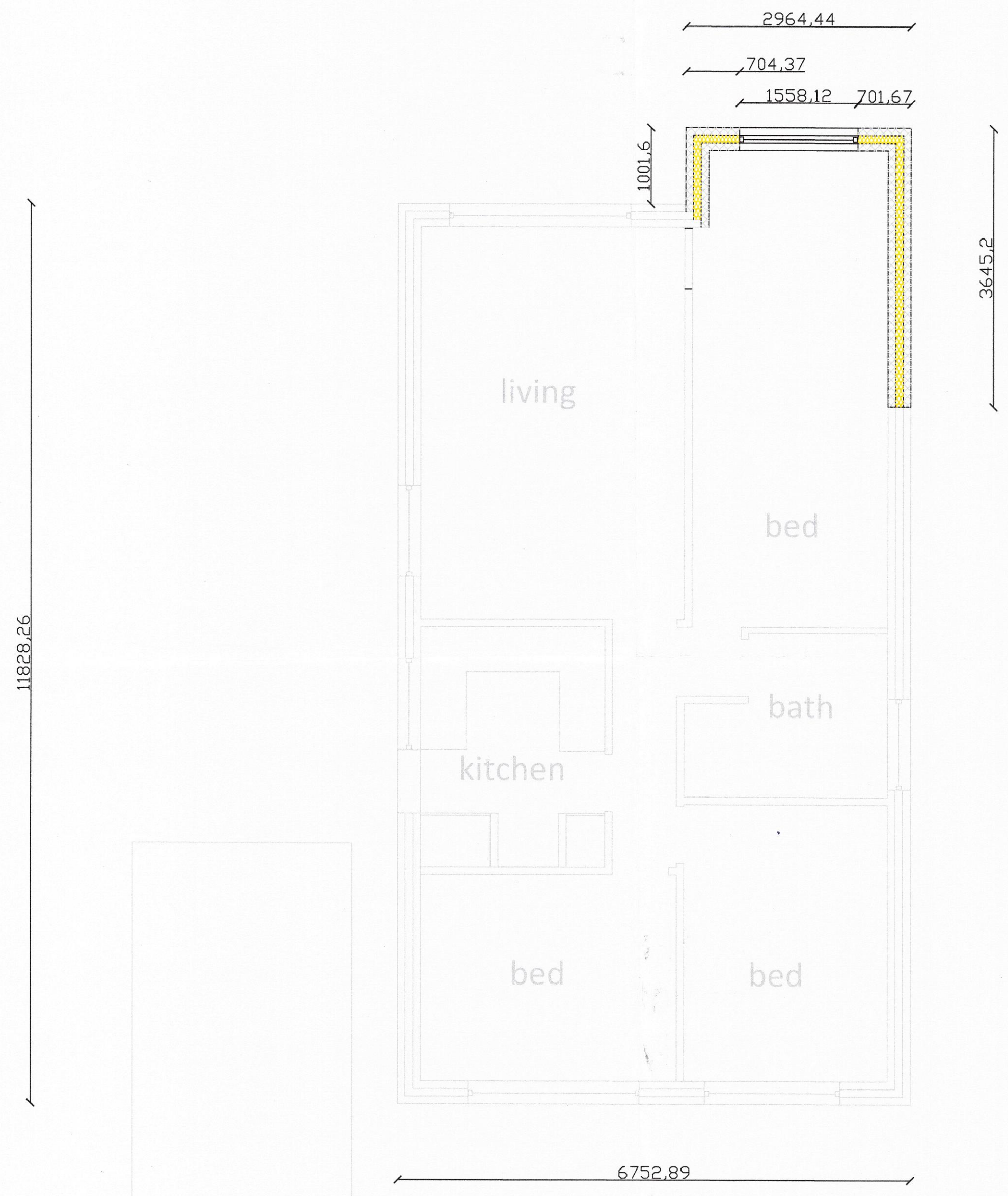
Proposed ground floor