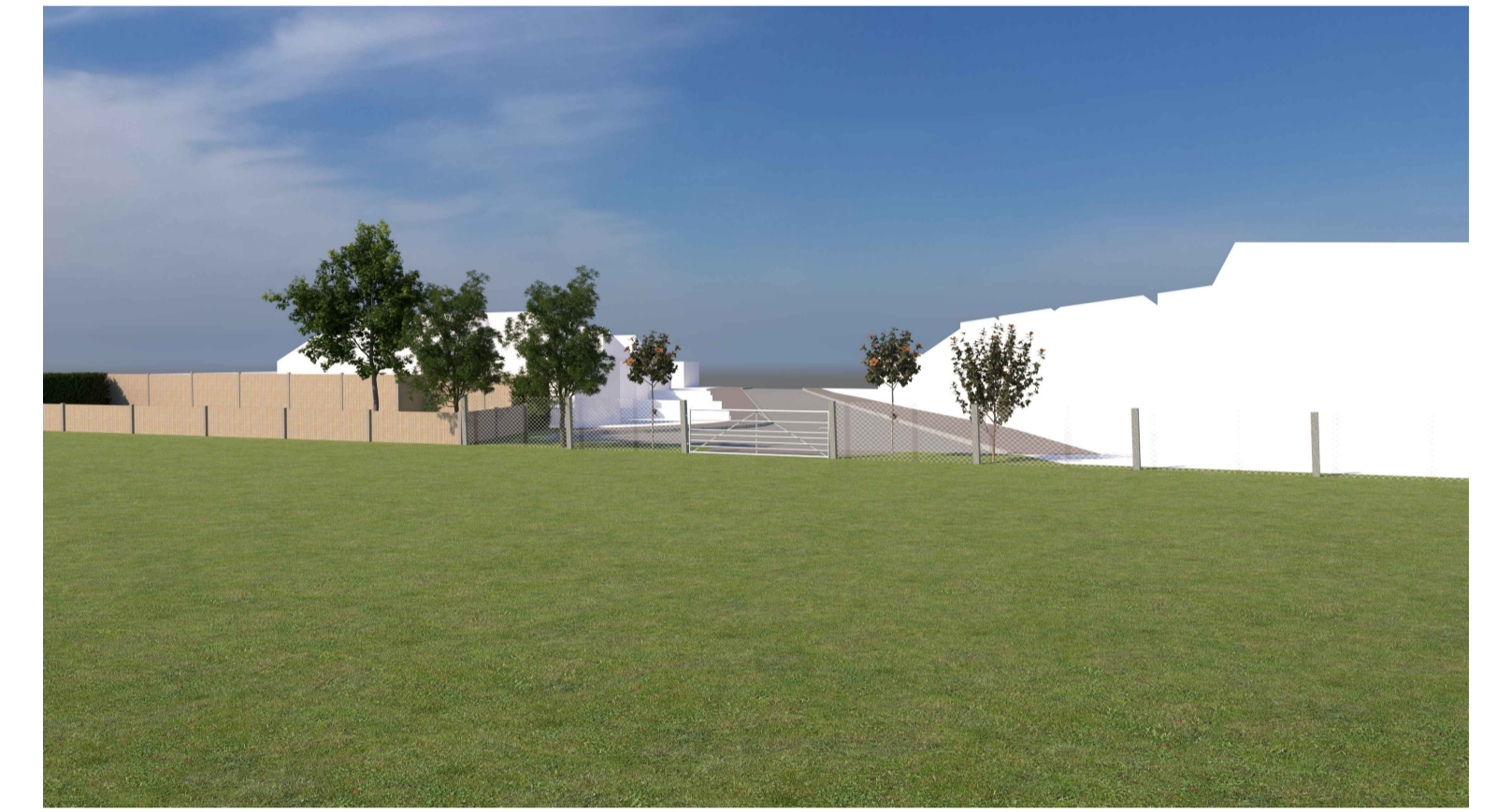
Existing Visuals (n.t.s)