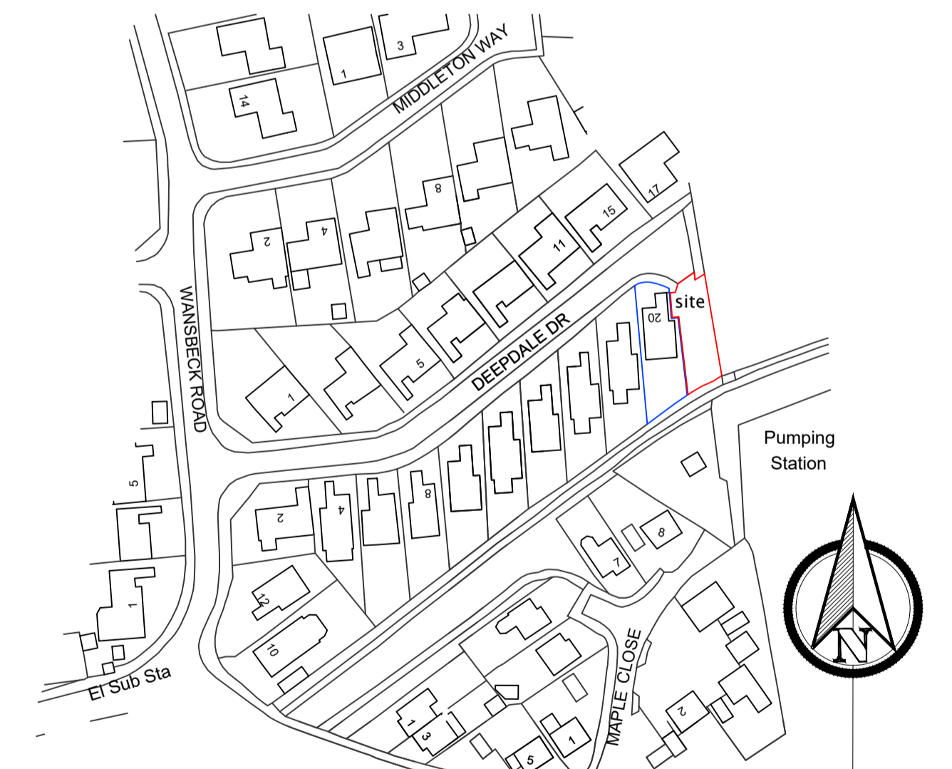
Site Location Plan (scale 1:1250)

Ordnance Survey, (c) Crown Copyright 2021. All rights reserved. Licence number 100022432