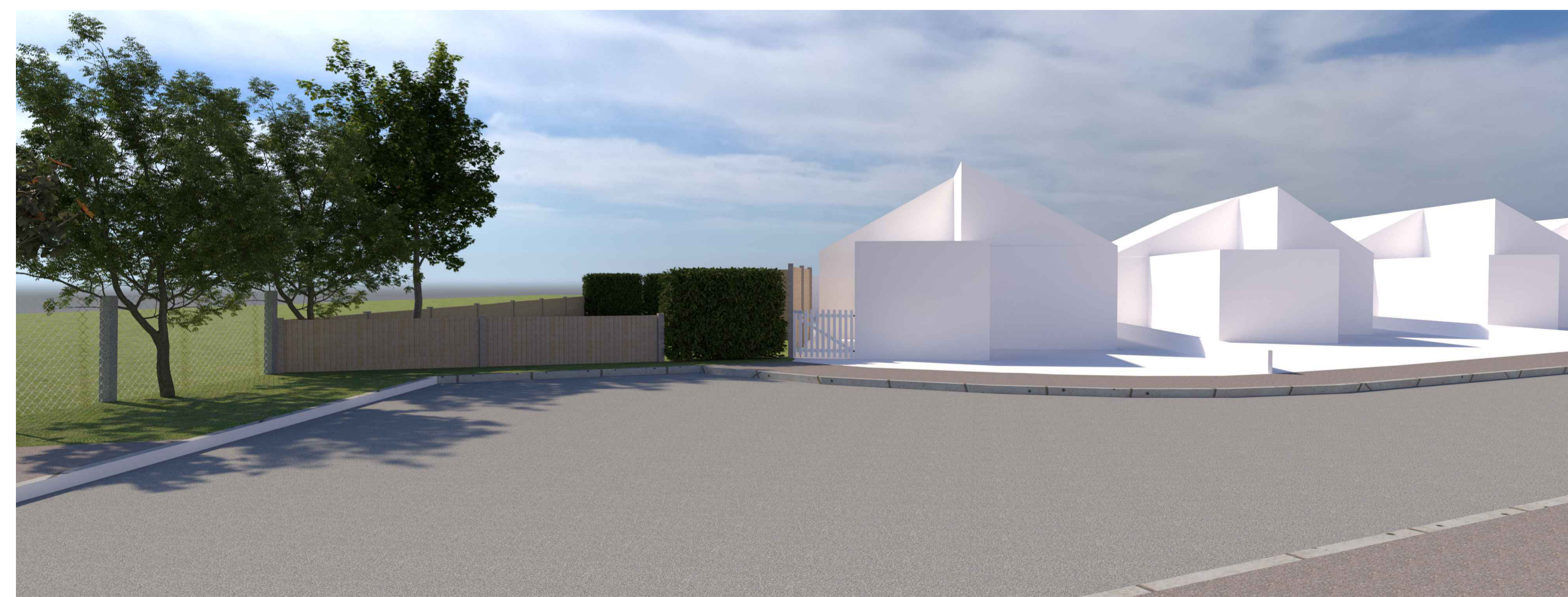
Existing Visuals (n.t.s)