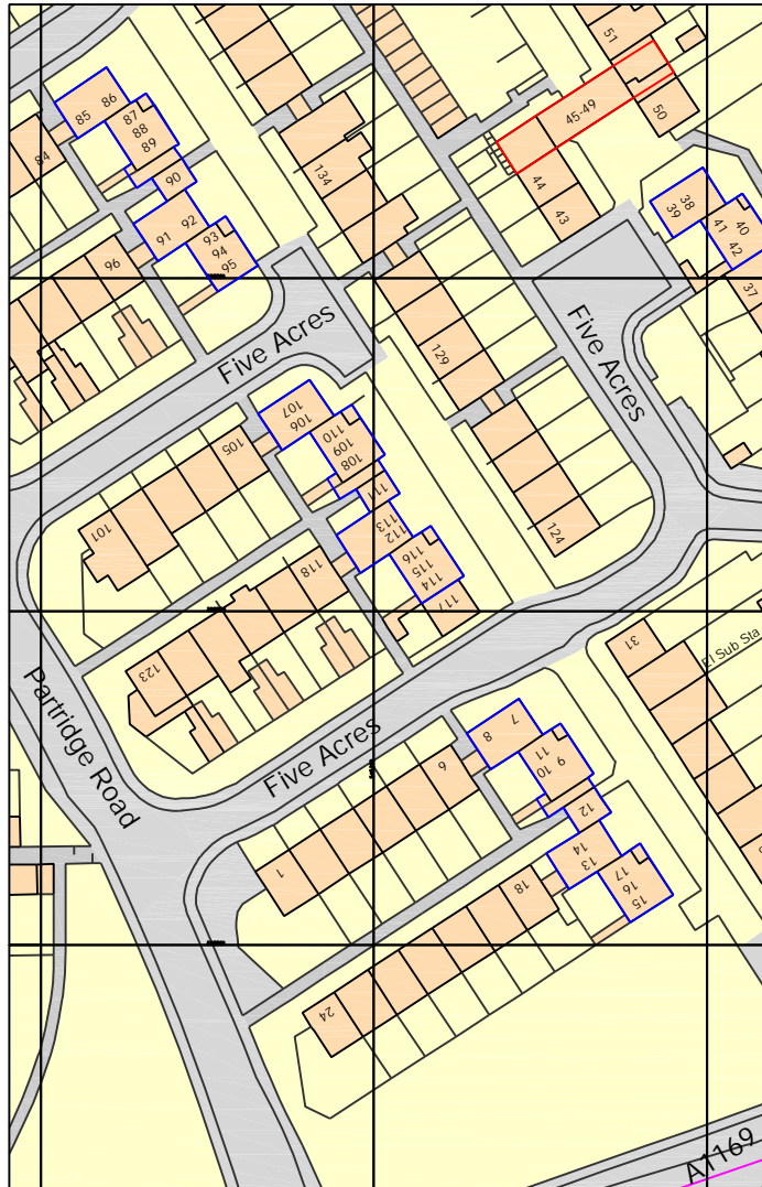
Ordnance Survey, (c) Crown Copyright 2021. All rights reserved. Licence number 100022432