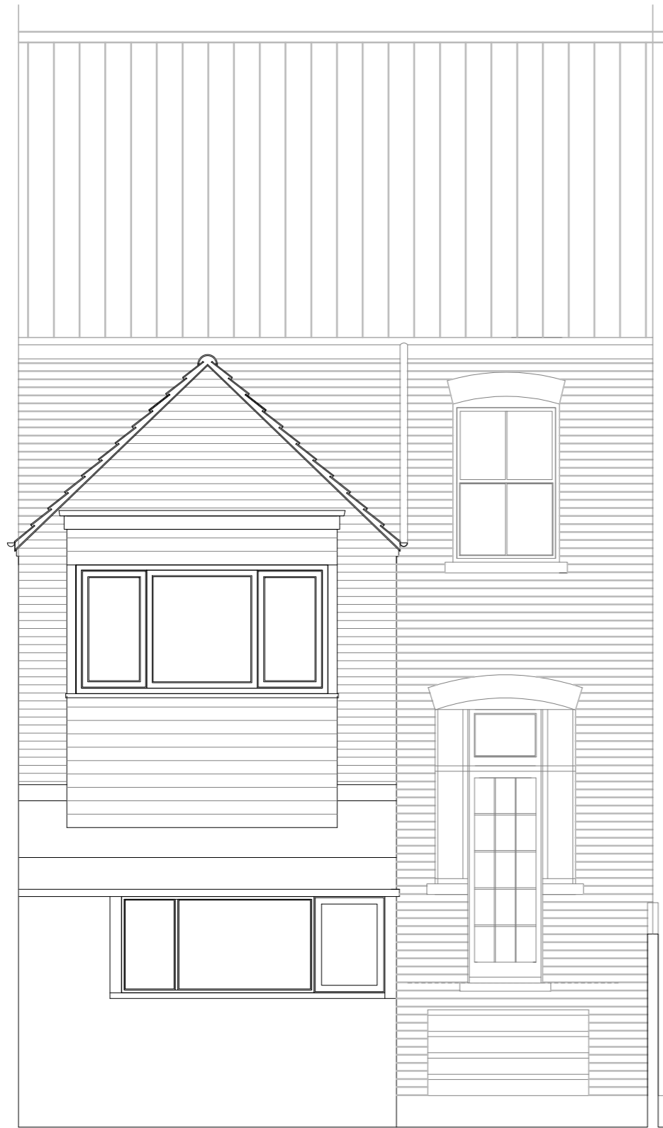
01 EXISTING REAR / NORTH ELEVATION SCALE 1:50