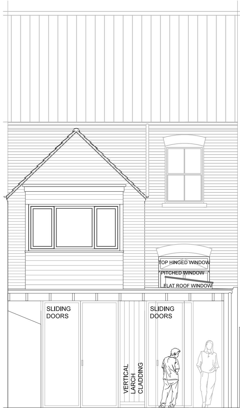
01 PROPOSED REAR / NORTH ELEVATION SCALE 1:50