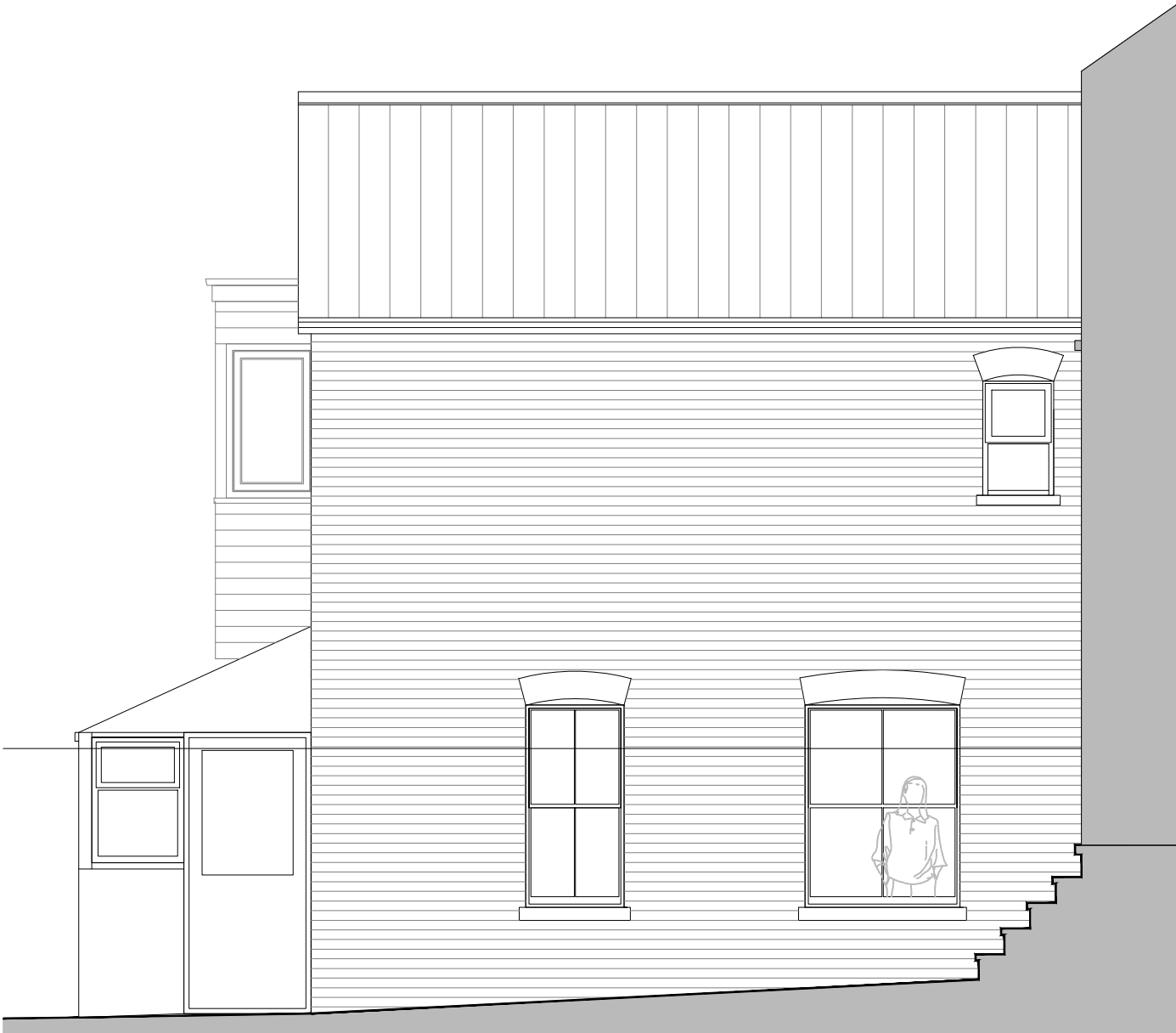
A 005 EXISTING SIDE / WEST ELEVATION SCALE 1:50