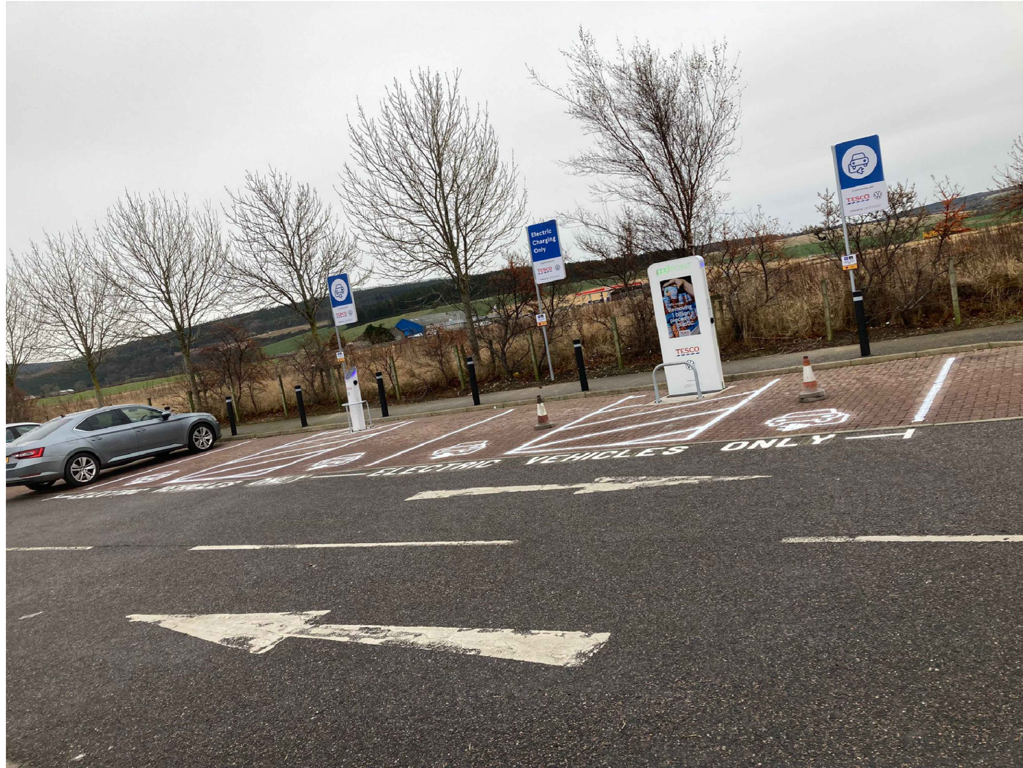
ELECTRIC VEHICLE-CHARGING AREA AT SITE