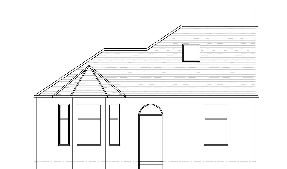
Front Elevation as Existing (no change)