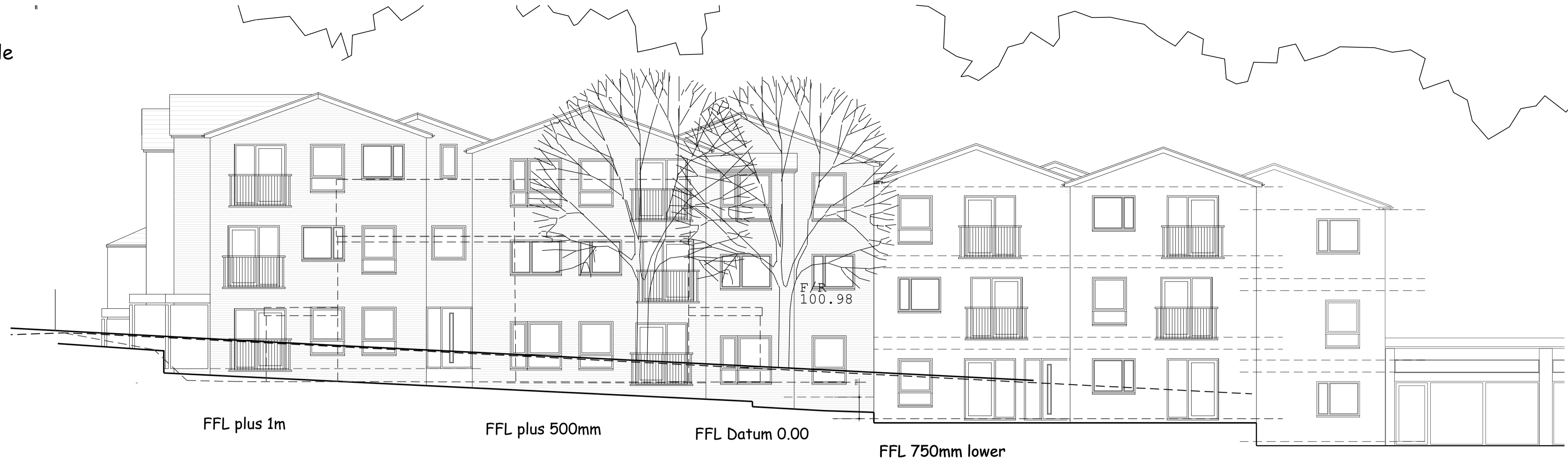
Street Elevation Burwell Road