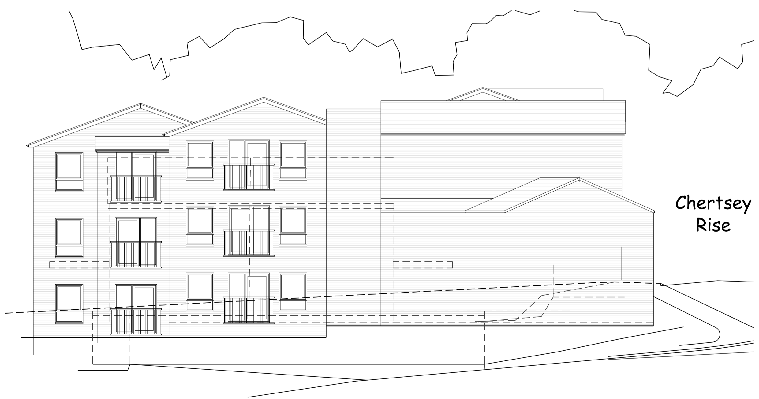
Rear Elevation (from service road)

notes: any discrepancies should be reported immediately all dimensions should be checked on site prior to commencement of work site/survey based on ordnance survey information provided by prodact systems plc. (www.promap.co.uk) prodact does not guarantee that all past or current uses or features will be identified in the product the product does not give details about the actual state or condition of the site nor should it be used or taken to indicate or exclude actual suitability or unsuitability of the site for any particular purpose, or relied upon for determining salability or value, or used as a substitute for any physical investigation or inspection. drawings to be read in accordance with the dwelling emission rate (derter) calculation, the building must be built 'as designed' meeting the criteria set for air permeability. © HERTFORD PLANNING SERVICE note when printing off pdfs, it is the responsibility of the user to verify that the resulting prints are to scale on the appropriate sized sheet, also that the scale bars on the plan measure correctly.