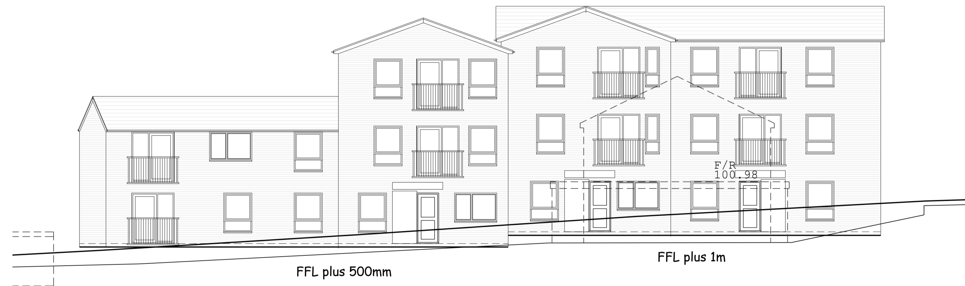
Elevation to Chertsey Rise