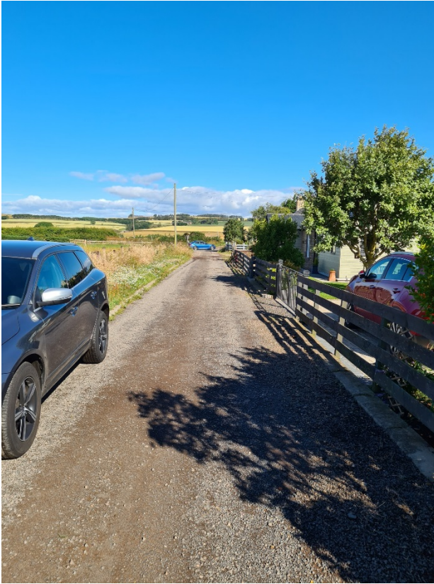
Existing access track length – A to B.