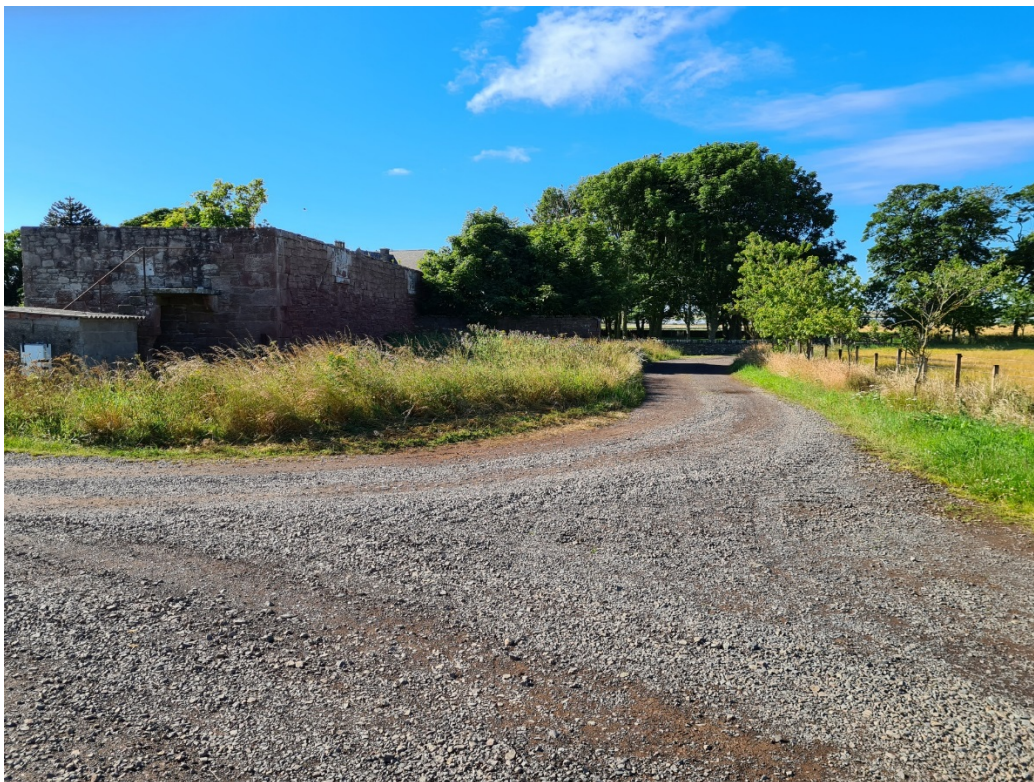
Full metallated access track – width 4.0m.