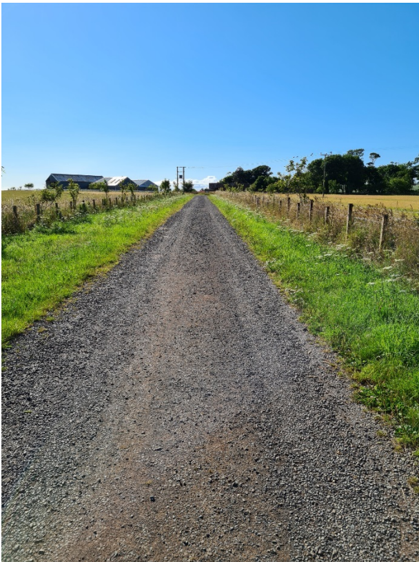
Full metallised access track – width 3.7m.