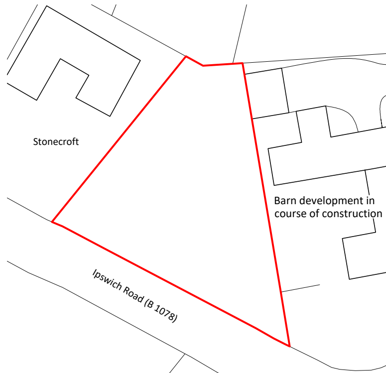
Site Plan As Existing 1:500