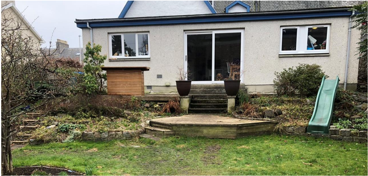
Existing photograph showing existing timber decking, flower bed to left and existing steps further to the left.