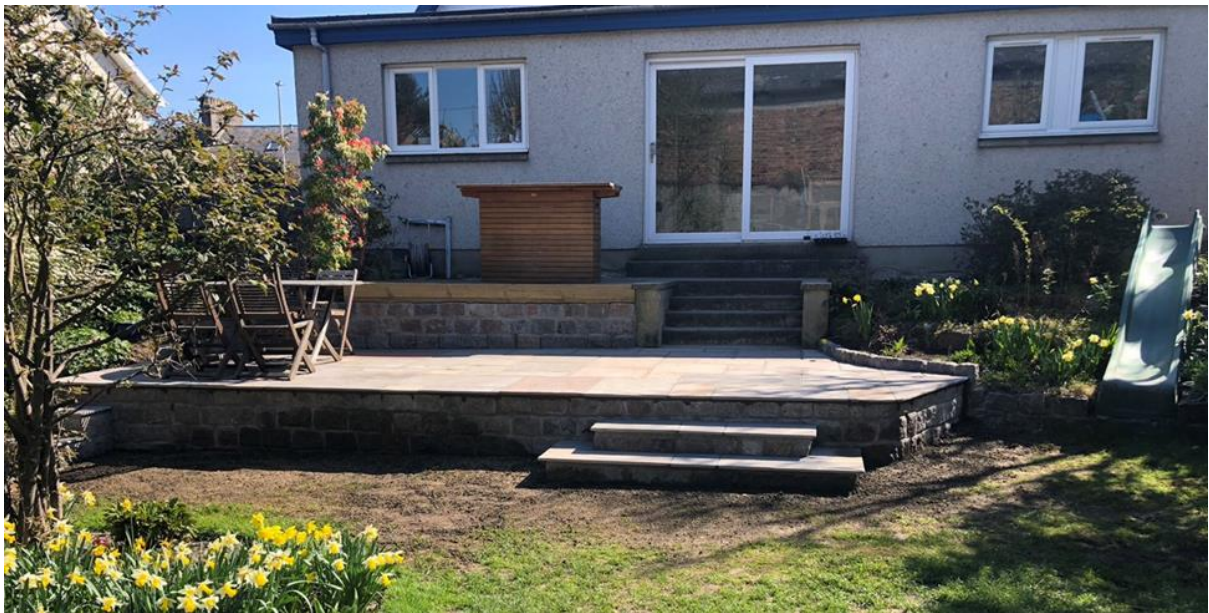
The replacement stone patio is the same distance out into the garden to the original but extends to the extend of the original steps to the left hand side of the photograph. The boundaires to either side of the extended patio are densely landscape screened to allow the applicant and both neighbours to retain privacy and amenity.