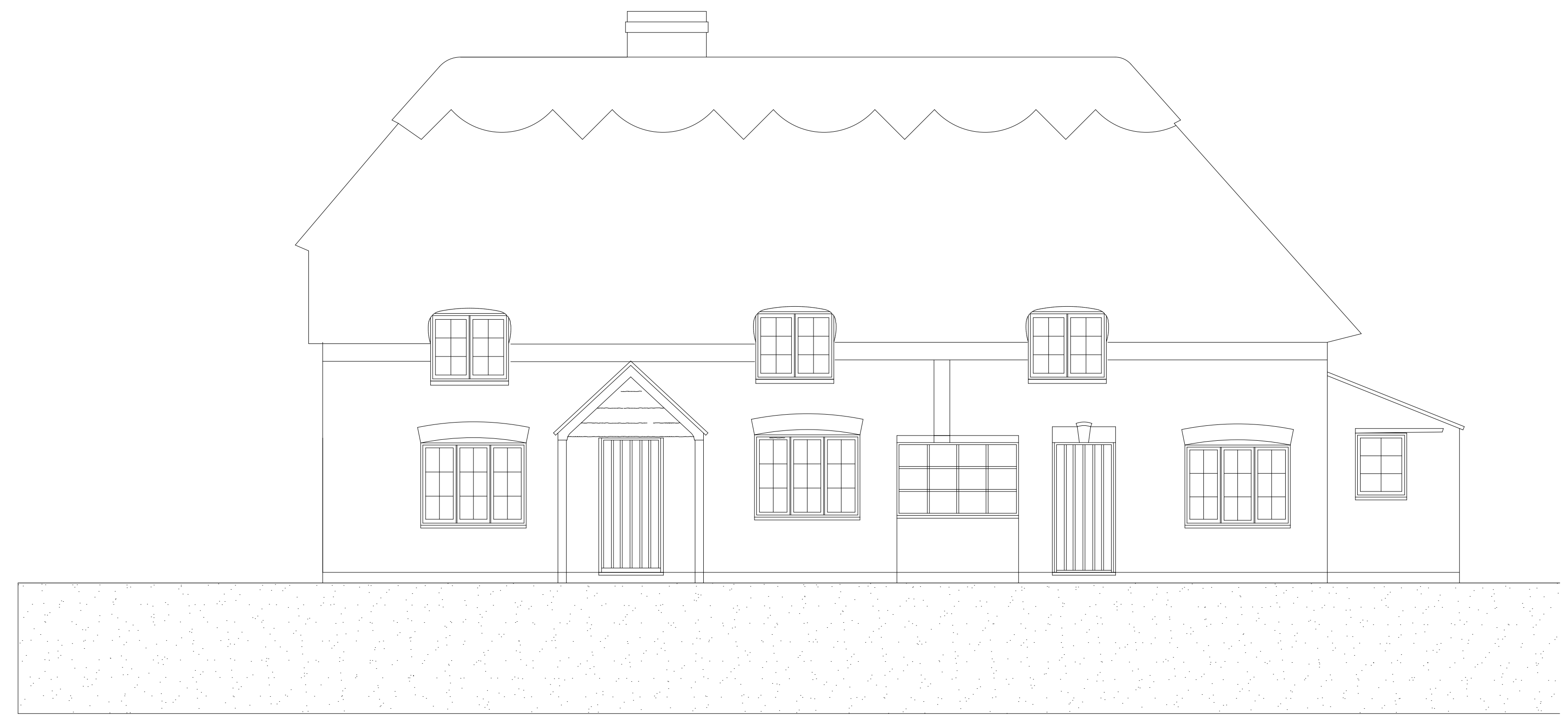
South Elevation Existing