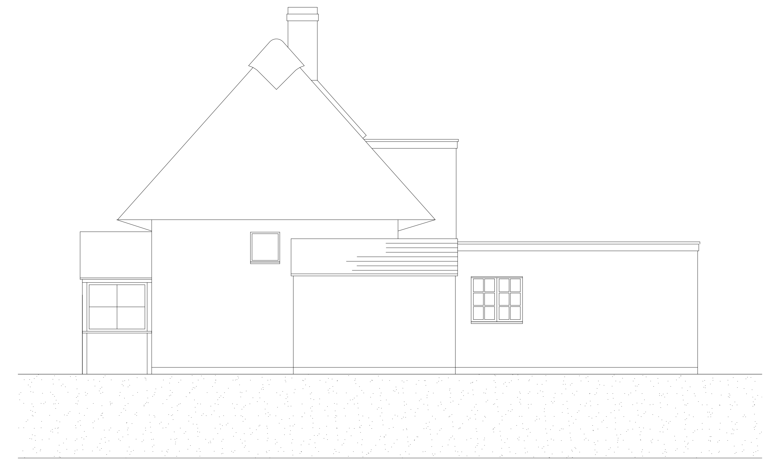
East Elevation Existing