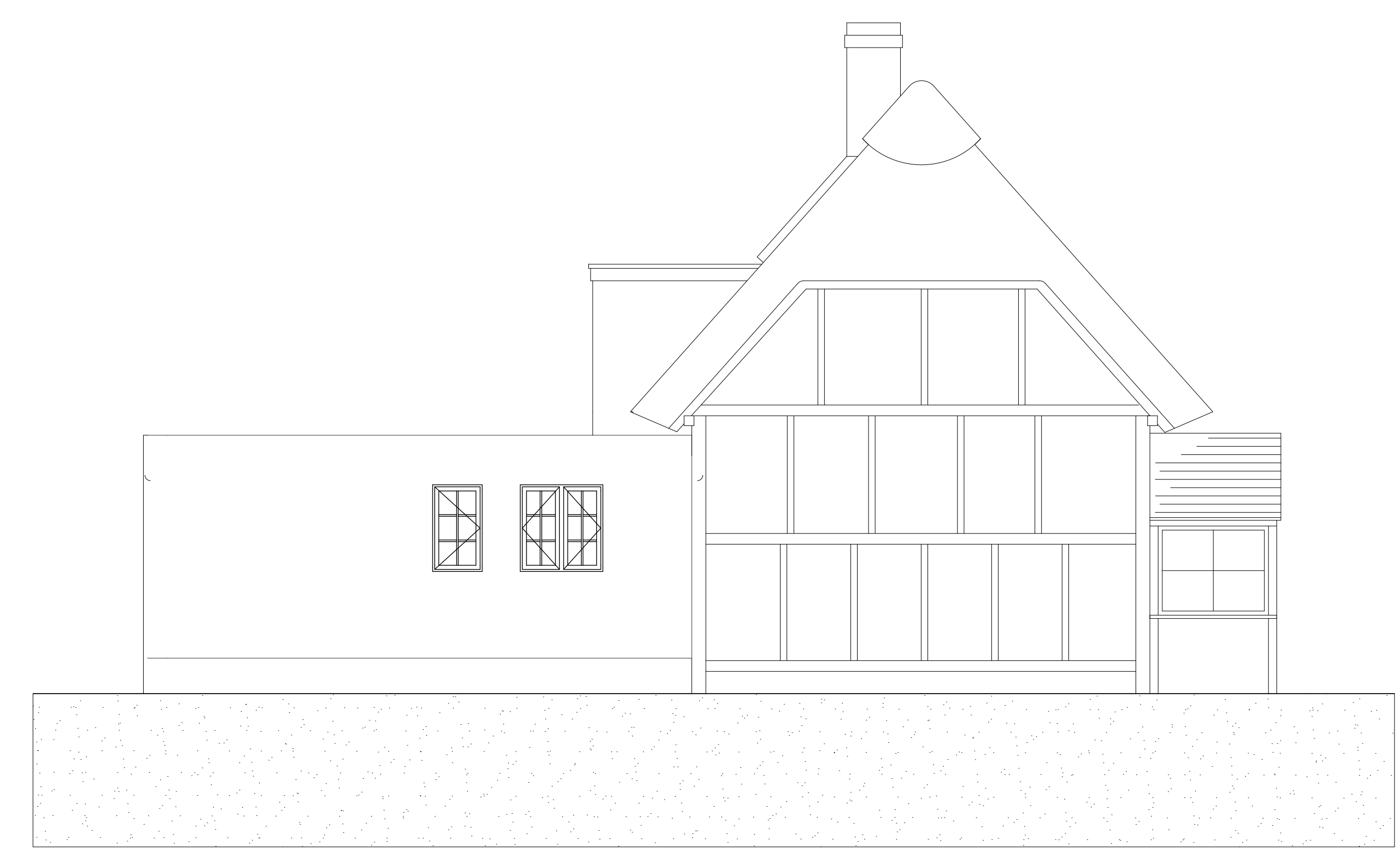
West Elevation Existing