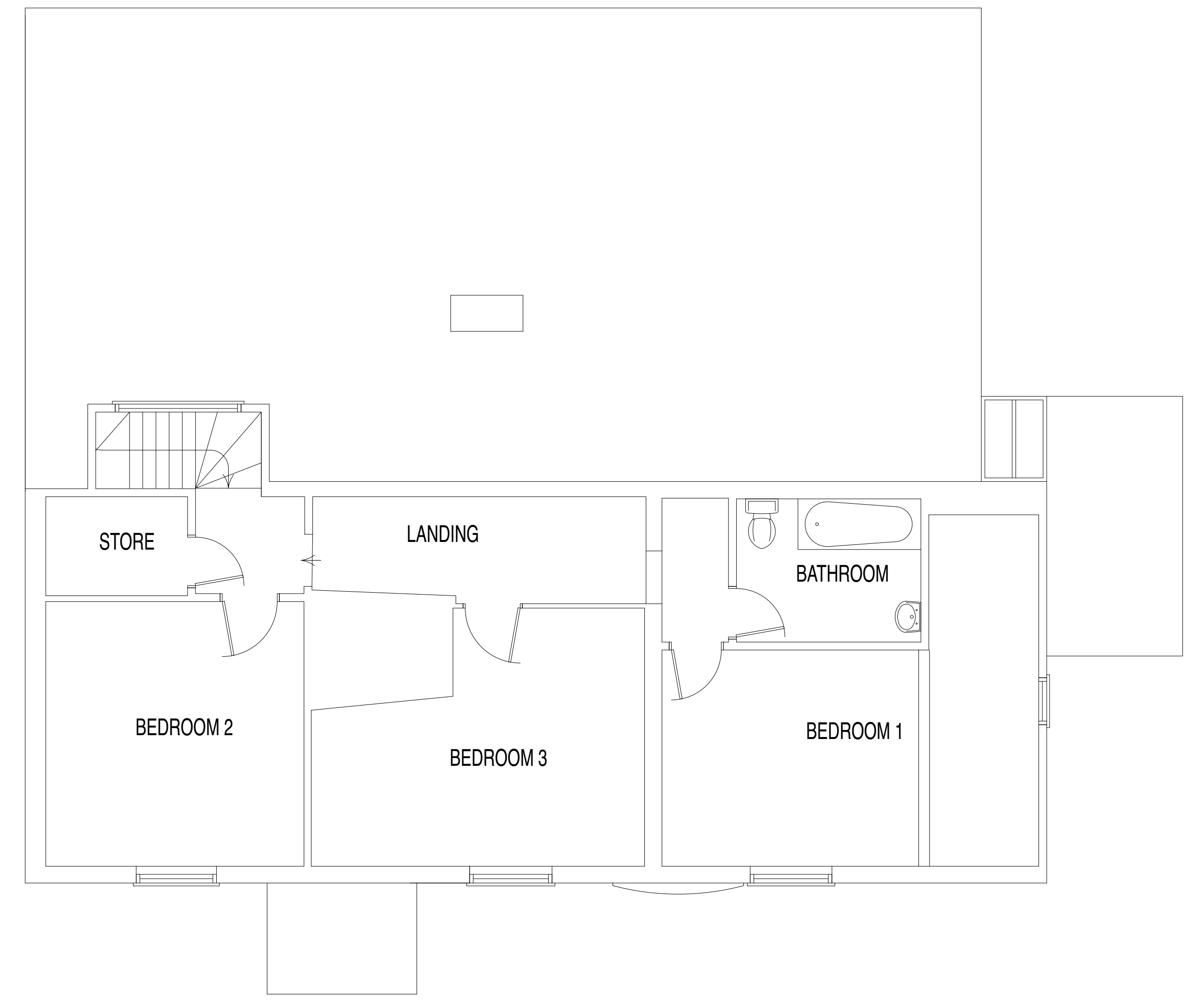
Extension Plan as Existing