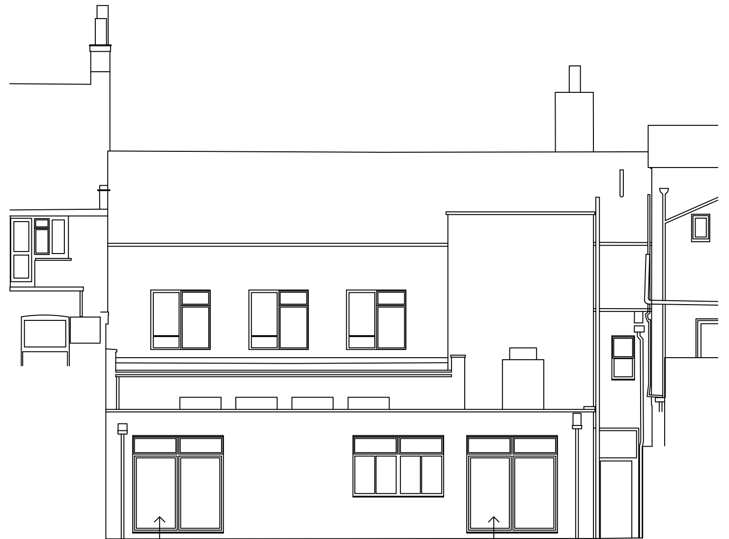
1 Proposed Front Elevation Scale : 1 : 100

Proposed Sliding Door in place of existing window to provide access to amenity space.