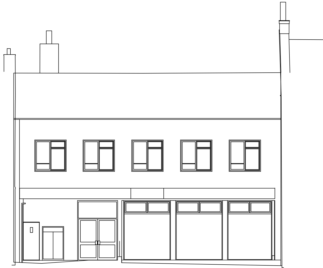
① Existing Front Elevation Scale: 1:100