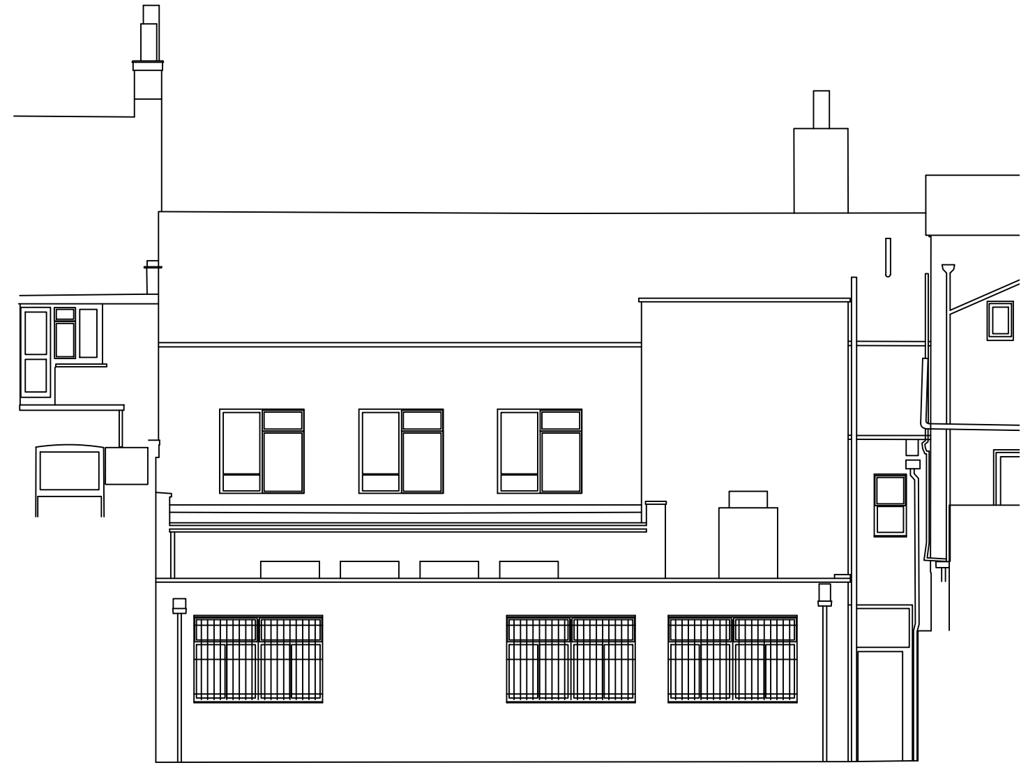
② Existing Rear Elevation Scale: 1:100

NOTES: 1. THIS DRAWING IS COPYRIGHT AND MUST NOT BE REPRODUCED IN WHOLE OR IN PART WITHOUT WRITTEN PERMISSION OF GAA DESIGN. 2. THIS DRAWING REPRESENTS DESIGN INTENT AND CONCEPT ONLY. HENCE IT CAN BE SCALED FOR PLANNING PURPOSES ONLY. 3. THIS DOCUMENT AND ALL ASSOCIATED DOCUMENTS ARE PREPARED FOR SPECIFIC SITE AND EVENT, AND INCORPORATE CALCULATIONS AND MEASUREMENTS AVAILABLE FROM THE CLIENT AT THE TIME OF DRAFTING. 4. THE RECEIPT AGREE TO PROTECT THE CONTENTS FROM DISTRIBUTION AND DISSEMINATION EXCEPT AS REQUIRED FOR THE SPECIFIC EVENT NAMED, WITHOUT THE WRITTEN PERMISSION OF THE DESIGNER. 5. USE OF THIS DESIGN IS GRANTED TO THE CLIENT FOR THE SPECIFIC AND NAMED EVENT ONLY. 6. COPYRIGHT © 2019