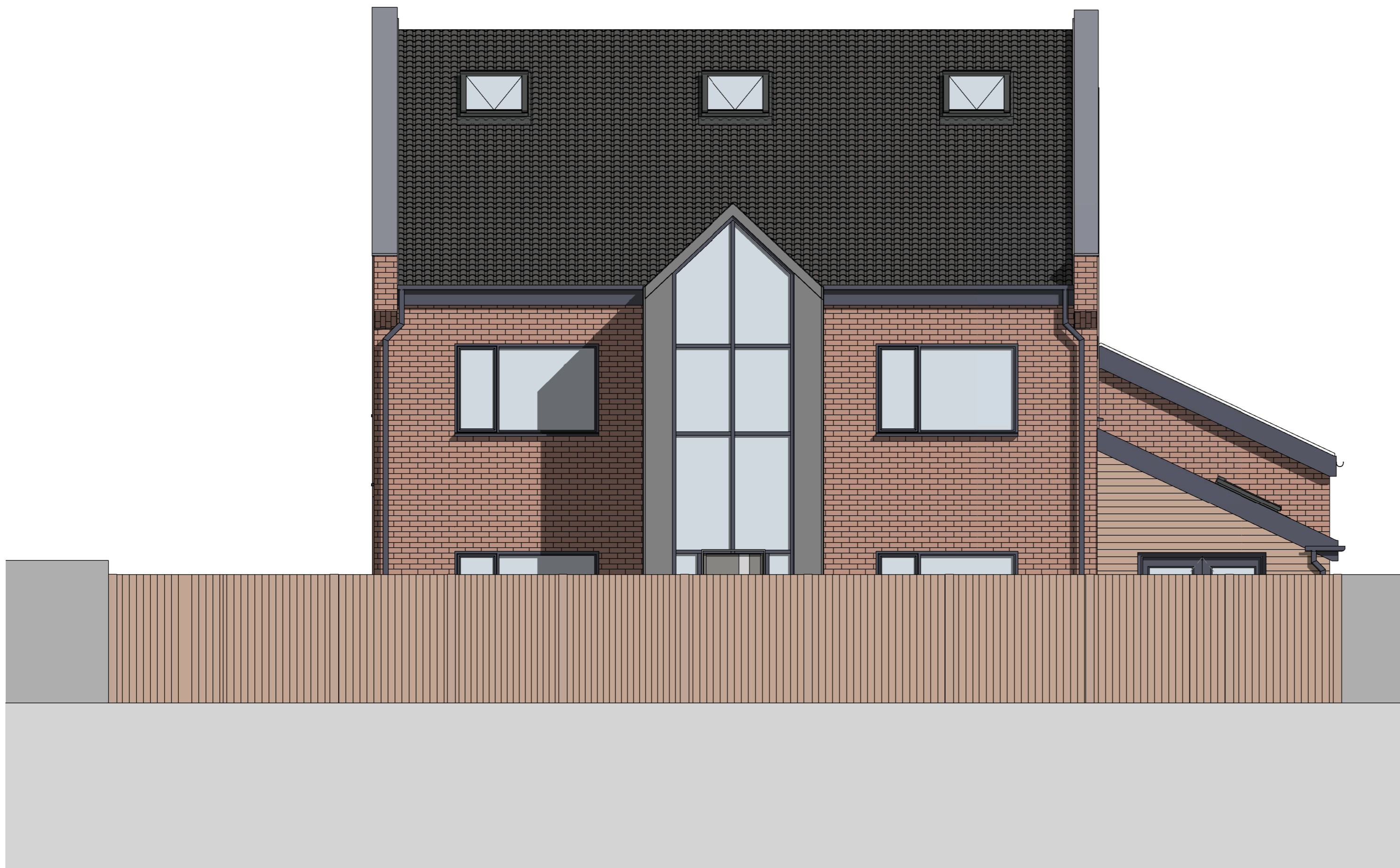
Front Elevation - Proposed Boundary Wall 1 : 50