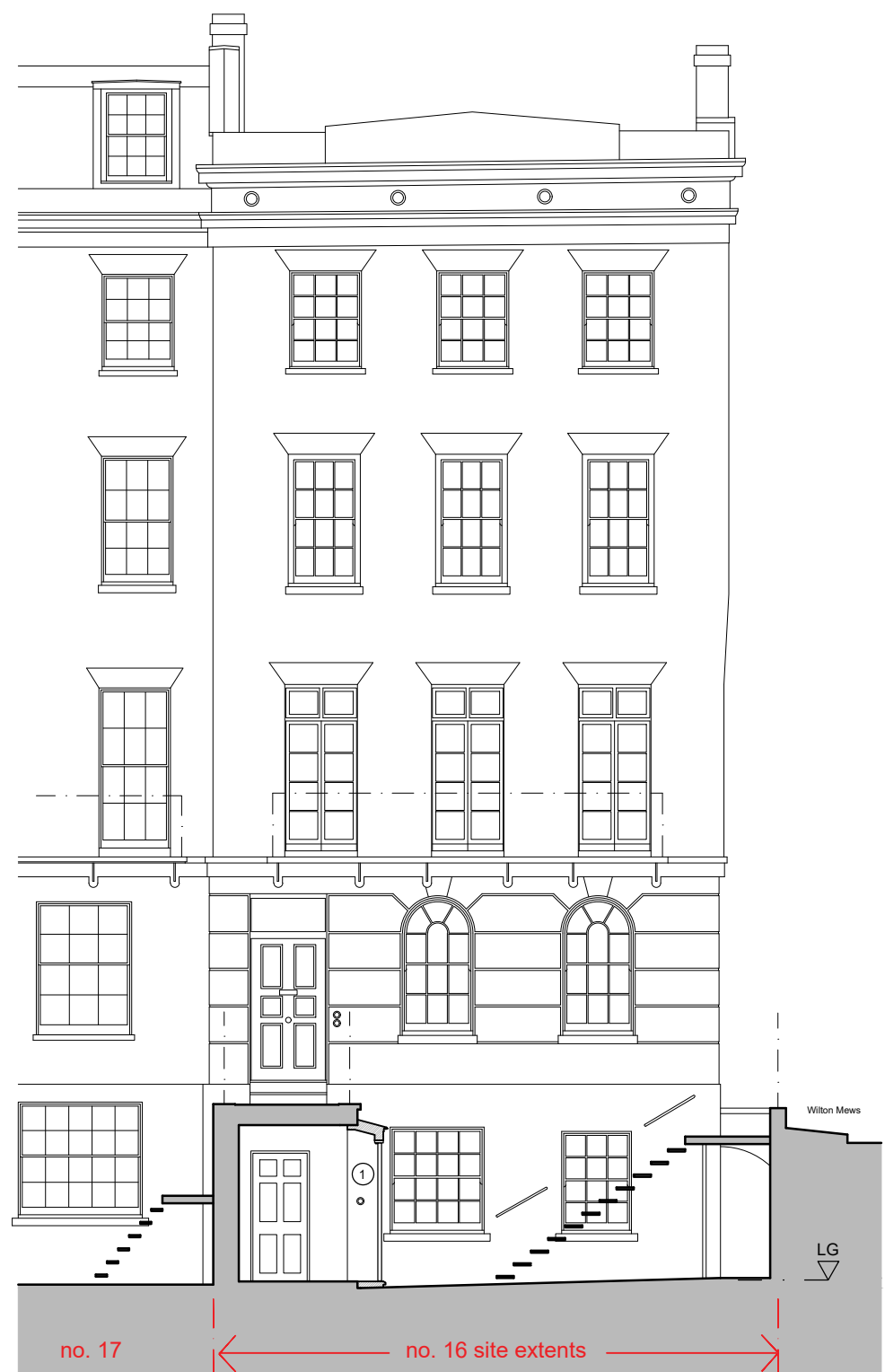
Front Elevation as Proposed