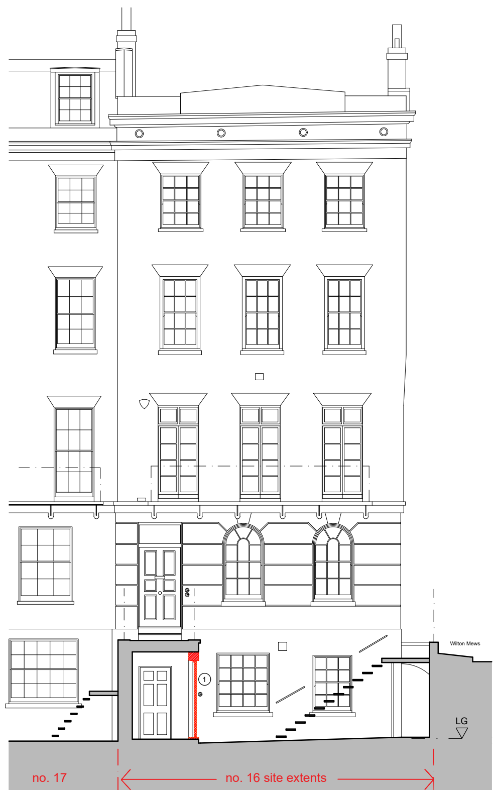
Front Elevation as Existing