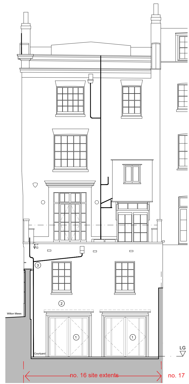
Schedule of Proposed Works