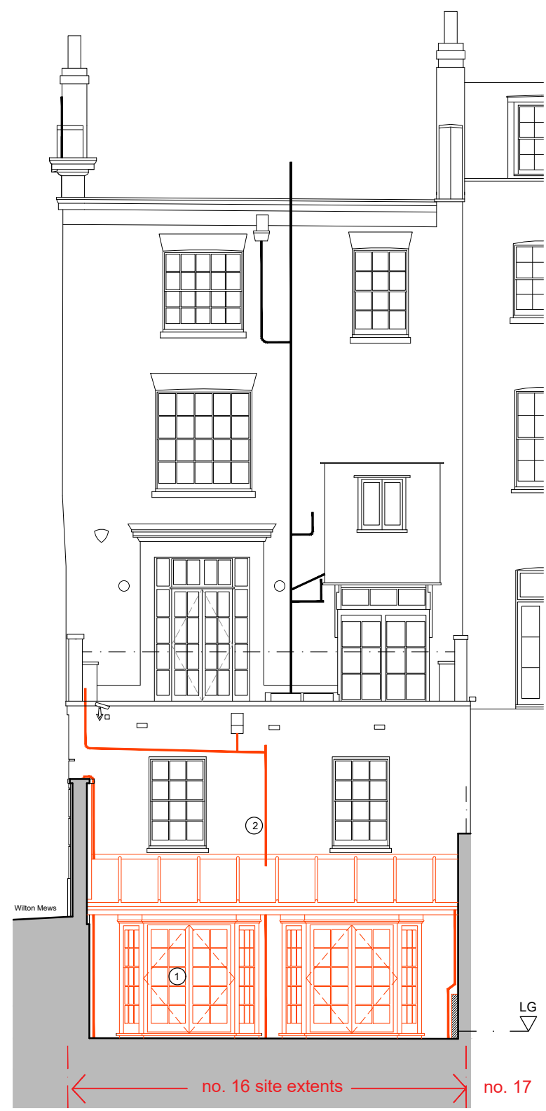
Schedule of Stripping-out Works