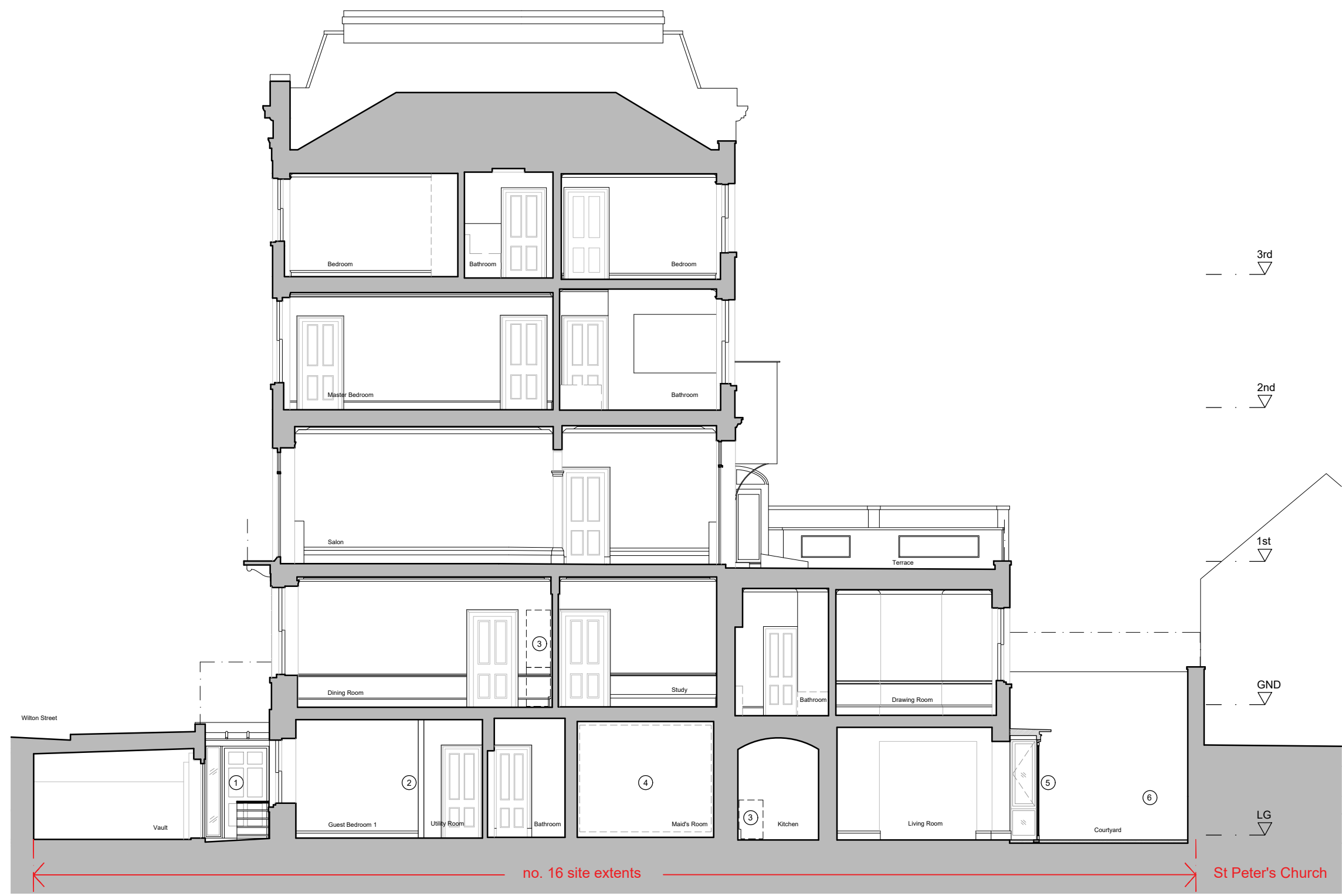
Section A-A as Proposed