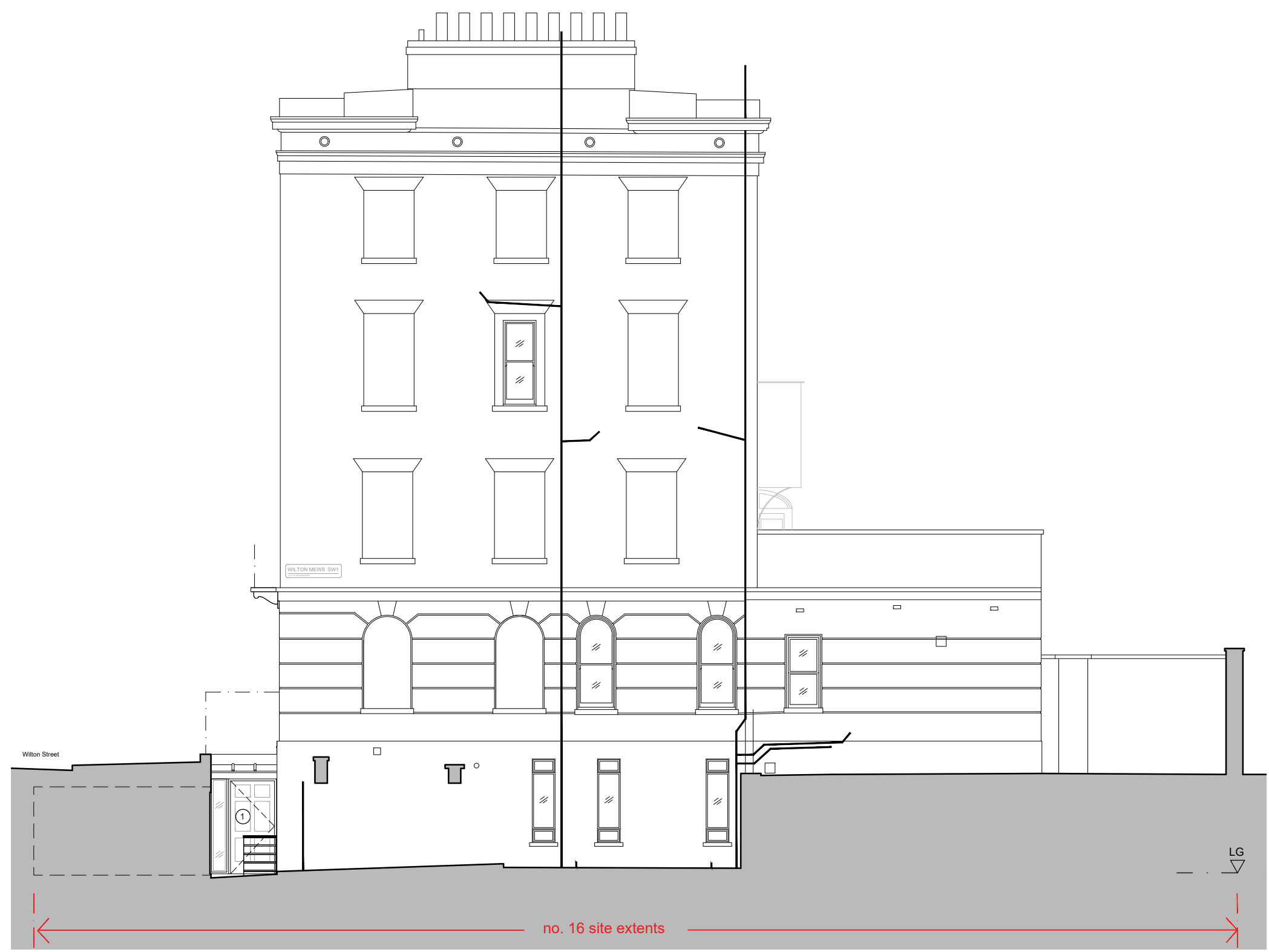
Side Elevation as Proposed