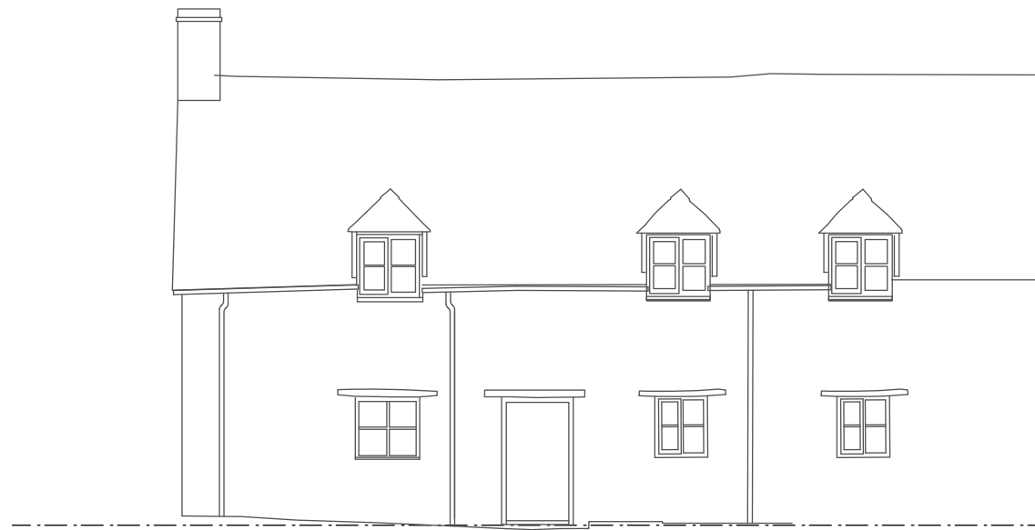
NORTH ELEVATION (street elevation)

NOTES: 1. This drawing and its design is the copyright of Cotswold Architects Ltd. and may not be reproduced in any form without their prior consent. 2. Do not scale off this drawing. 3. Dimensions to be checked on site.