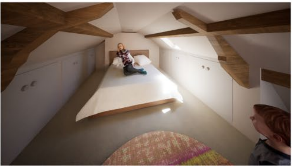
Proposed Bedroom - view to highlight spatial requirements of room when double bed is used in room. Room to stay mainly as existing