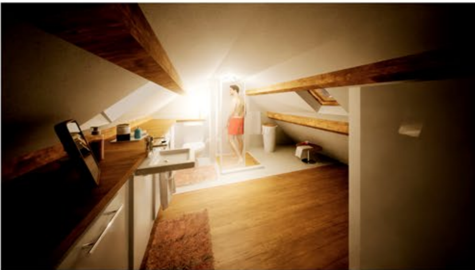
Proposed Bathroom - typical indication of artificial lighting being used in a night-time scenario. Well lit facing rear end of room