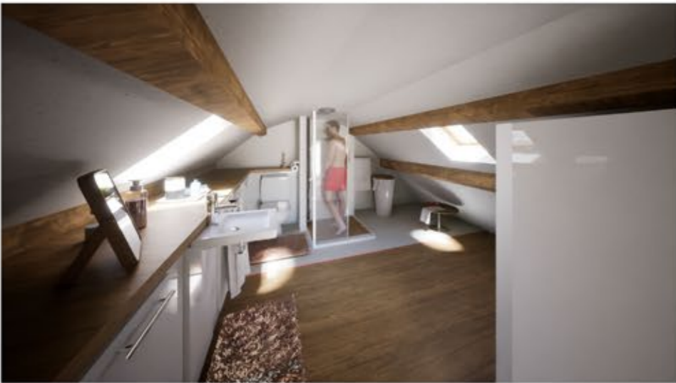
Proposed Bathroom - view showing all fittings and cupboard storage running along and under existing beams