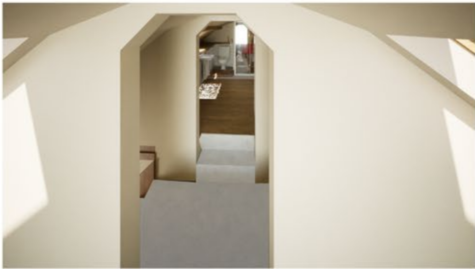
Proposed Landing - view showing changes in floor level and head height to allow for improved access into and across the loft