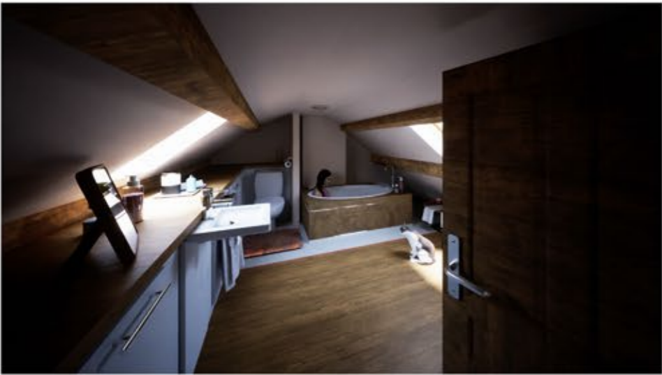
Proposed Bathroom - view highlighting improve access when bath is installed. Scene highlights lighting at early morning