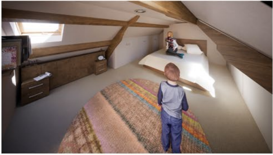
Proposed Bedroom - view to highlight the creation of the new roof light at the rear side while also increasing available storage