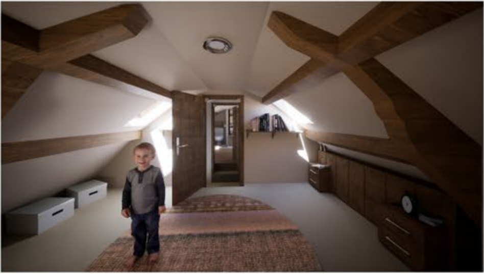
Proposed Bedroom - indicative view highlighting the retention of all roof beams while adjusting the line of sight between two loft areas