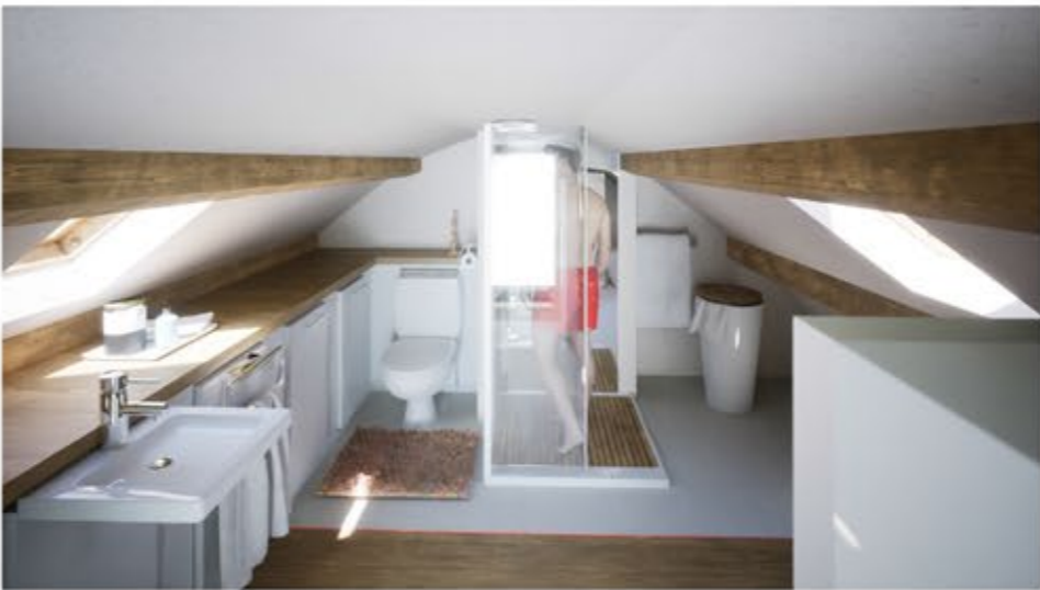
Proposed Bathroom - view showing restrictions of head height when retaining exposed room beams along side new velux window