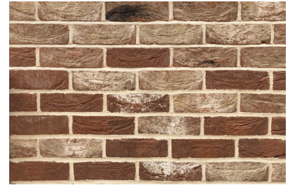
Facing Bricks: Vandersanden Flemish Antique Bricks - metric sizes