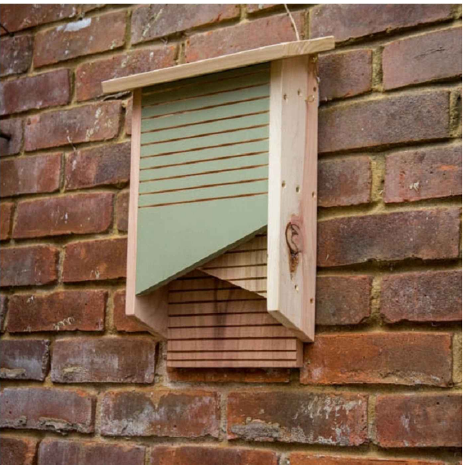
ITEM 1 - Bat Box Ark Wildlife Conservation Bat Box 450h x 330w x 140d