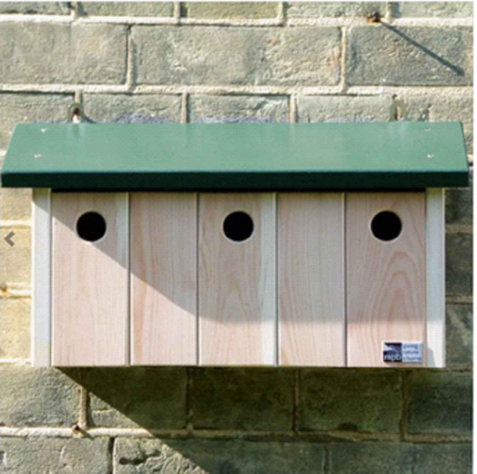
ITEM 2 - Sparrow Terrace RSPB Sparrow Terrace Nest Box 480w x 230w x 170d