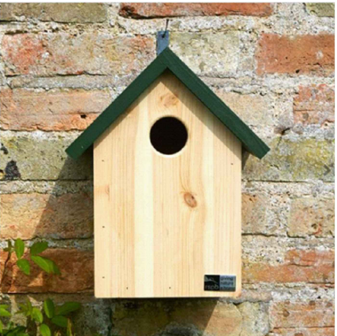
ITEM 3 - Starling Box RSPB Apex Starling Nest Box 315h x 185w x 180d