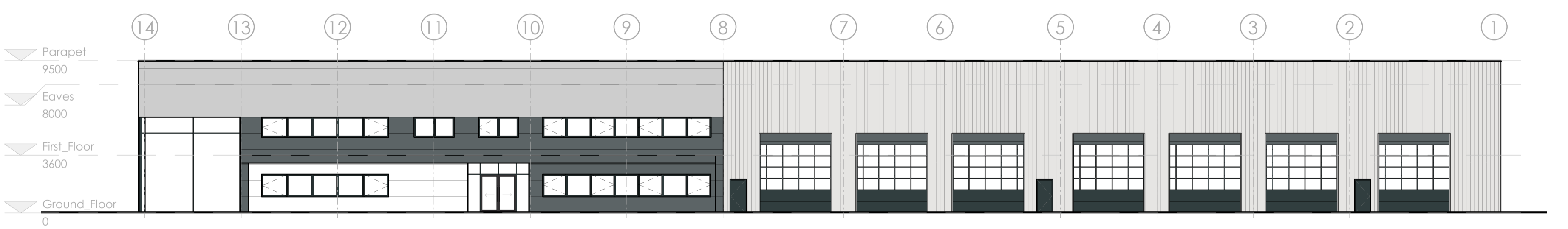
04-North_Elevation 1 : 200