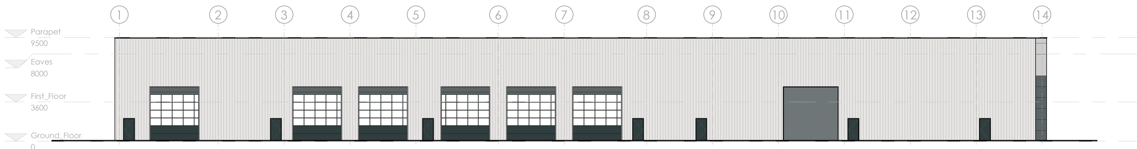
02-South_Elevation 1 : 200