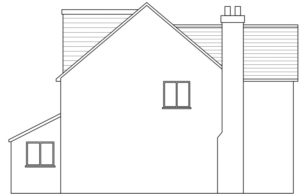
PROPOSED SIDE ELEVATION materials to match existing