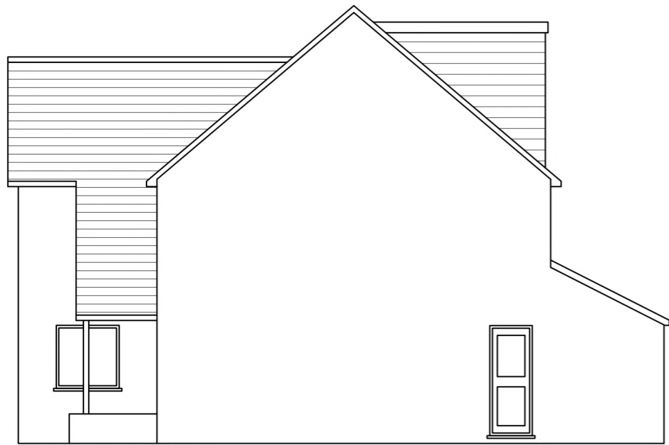
PROPOSED SIDE ELEVATION materials to match existing