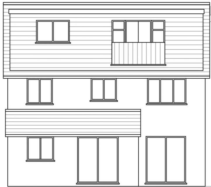
PROPOSED REAR ELEVATION materials to match existing