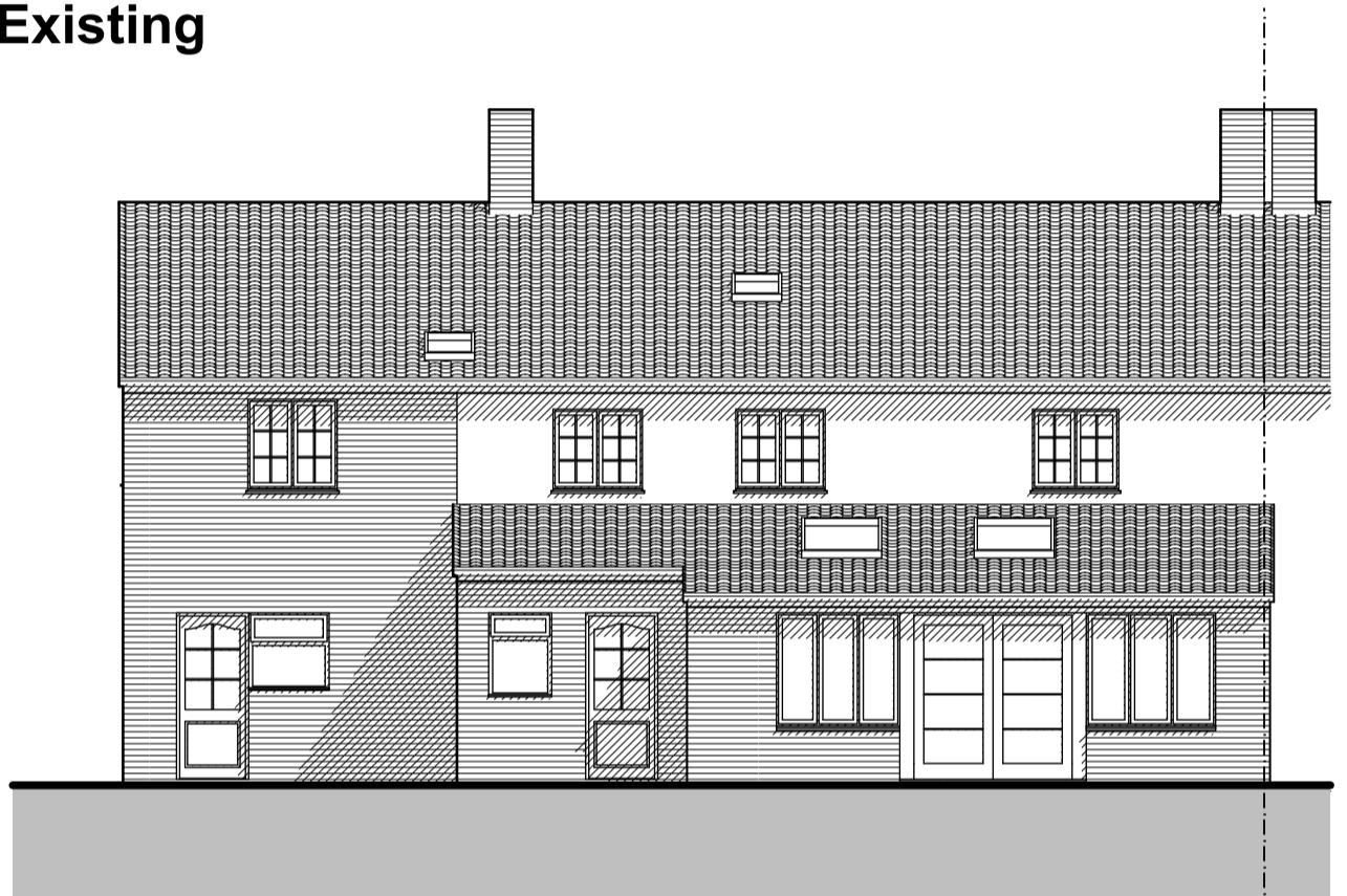
NORTH ELEVATION - Existing