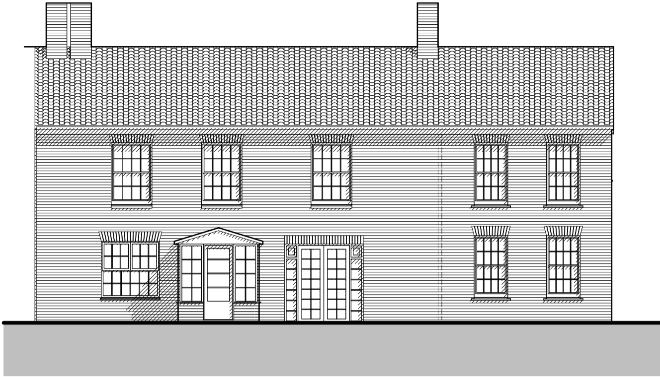
SOUTH ELEVATION - Existing