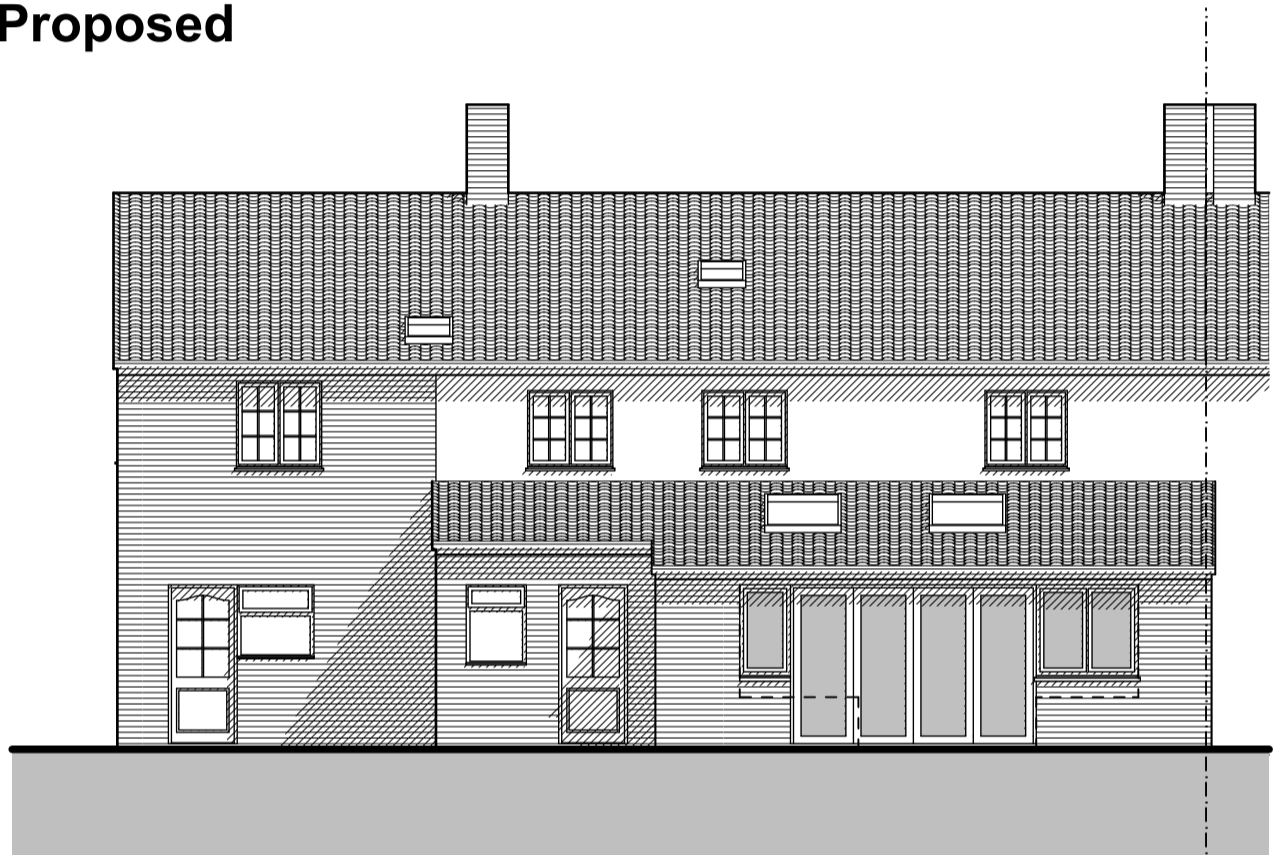
NORTH ELEVATION - Proposed