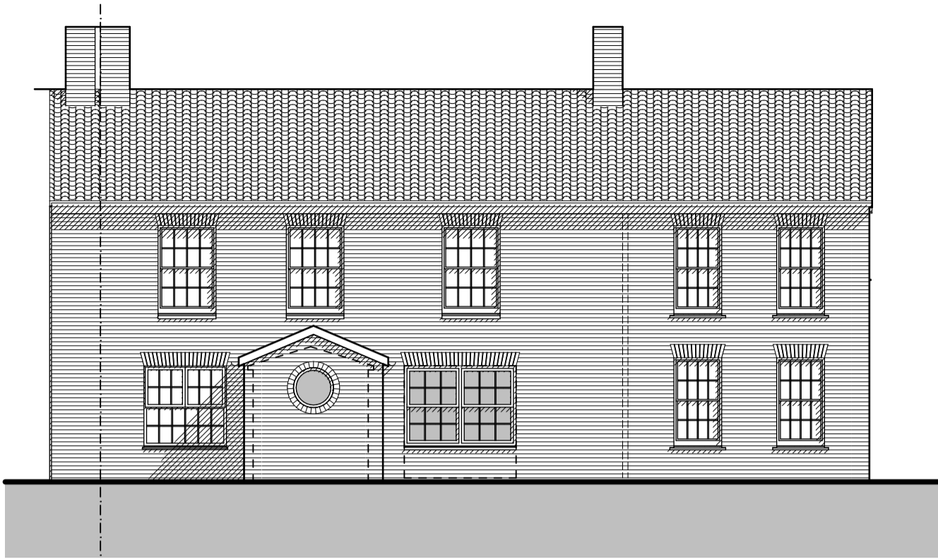
SOUTH ELEVATION - Proposed