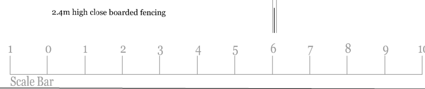
FIRST FLOOR LAYOUT ~ HOUSE 1