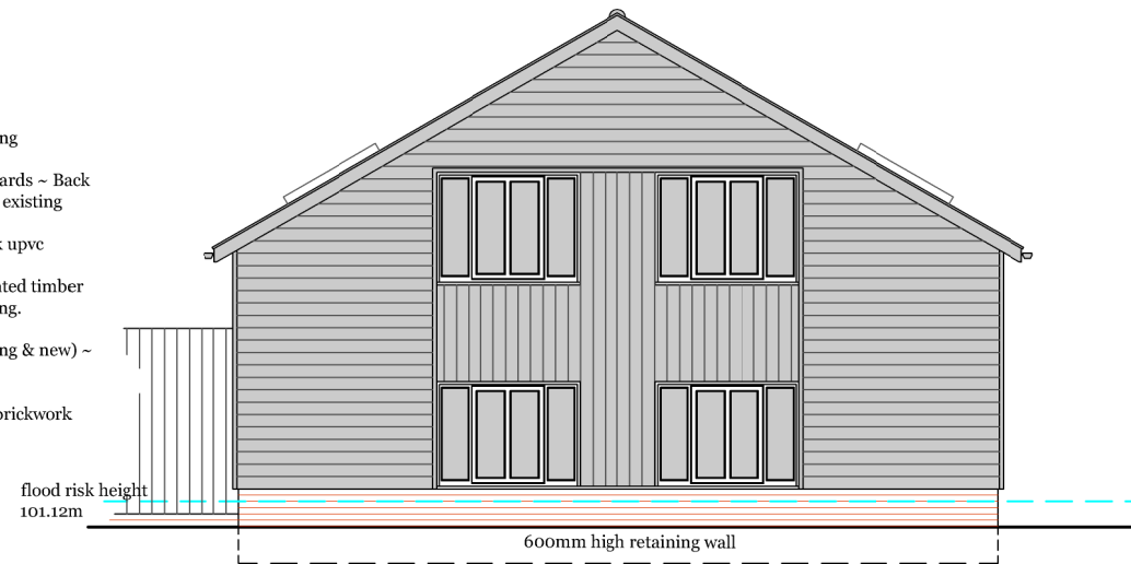
SIDE ELEVATION (NORTHEAST)~ HOUSE 1