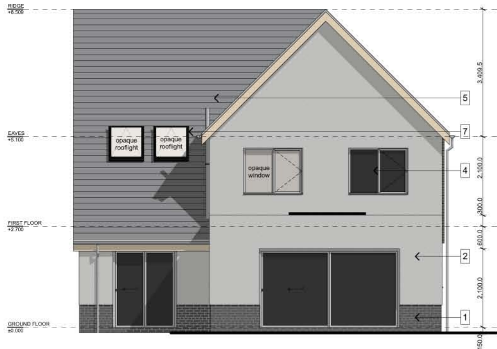
REAR HT1A Elevation