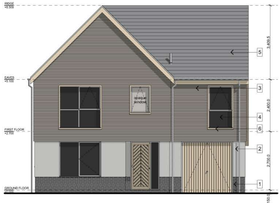
FRONT HT1A Elevation