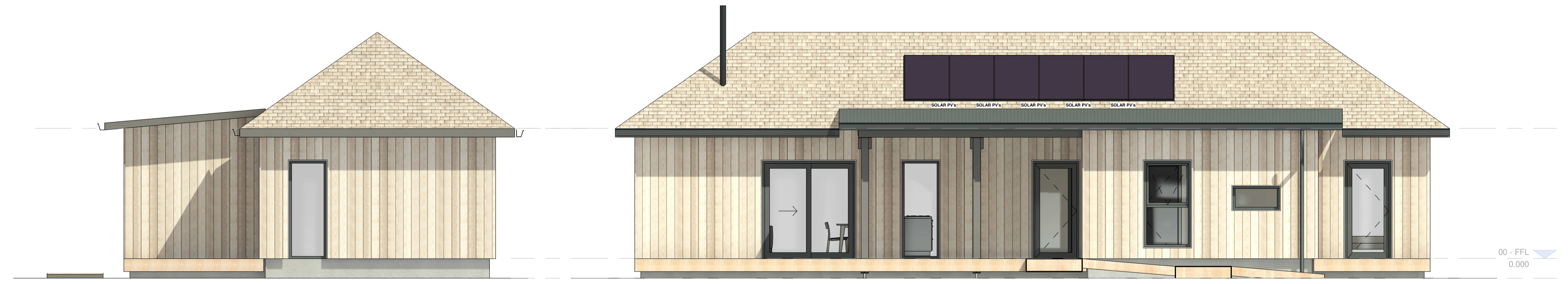
East Elevation 1 : 50