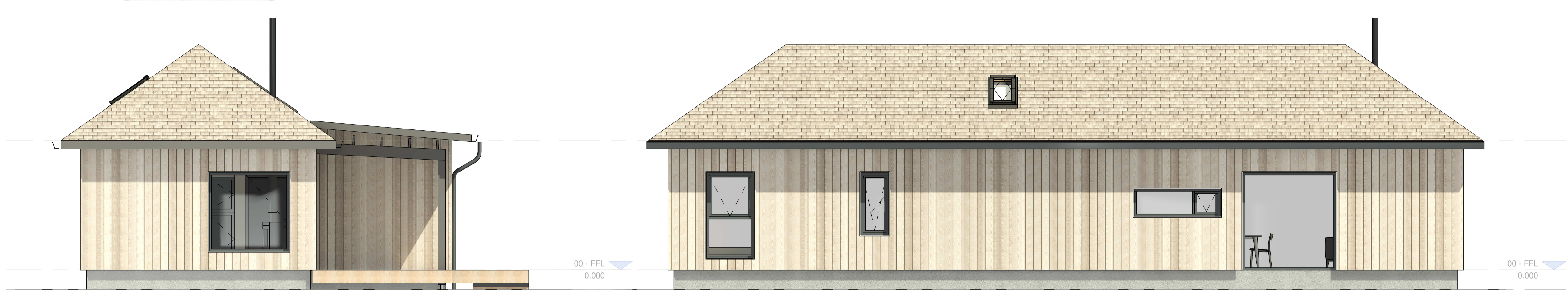
West Elevation 1 : 50