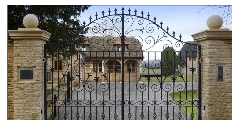
PROPOSED ELECTRIC WROUGHT IRON GATES WITH CCTV, CONTROL PANEL AND LIGHTING