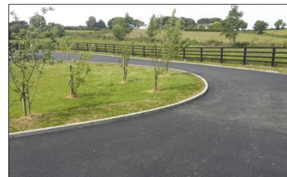
PROPOSED EDGING KERB & TARMAC IN KEEPING WITH EXISTING