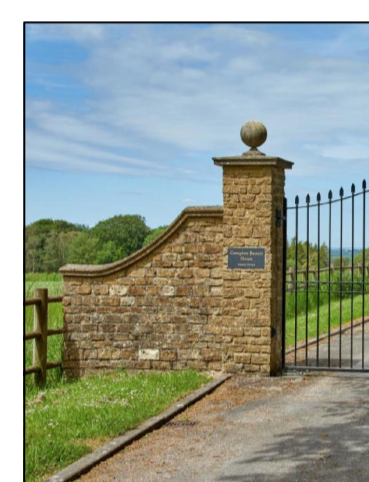
PROPOSED SANDSTONE WALLS WITH CAPPING, CAST STONE BALL FINIALS AND PLINTH