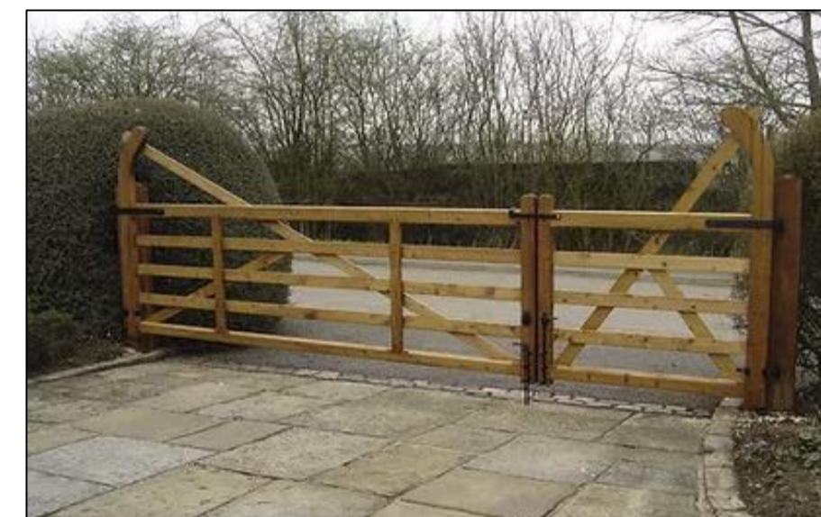
PROPOSED FIELD ACCESS - TIMBER DOUBLE ESTATE 5 BAR GATE