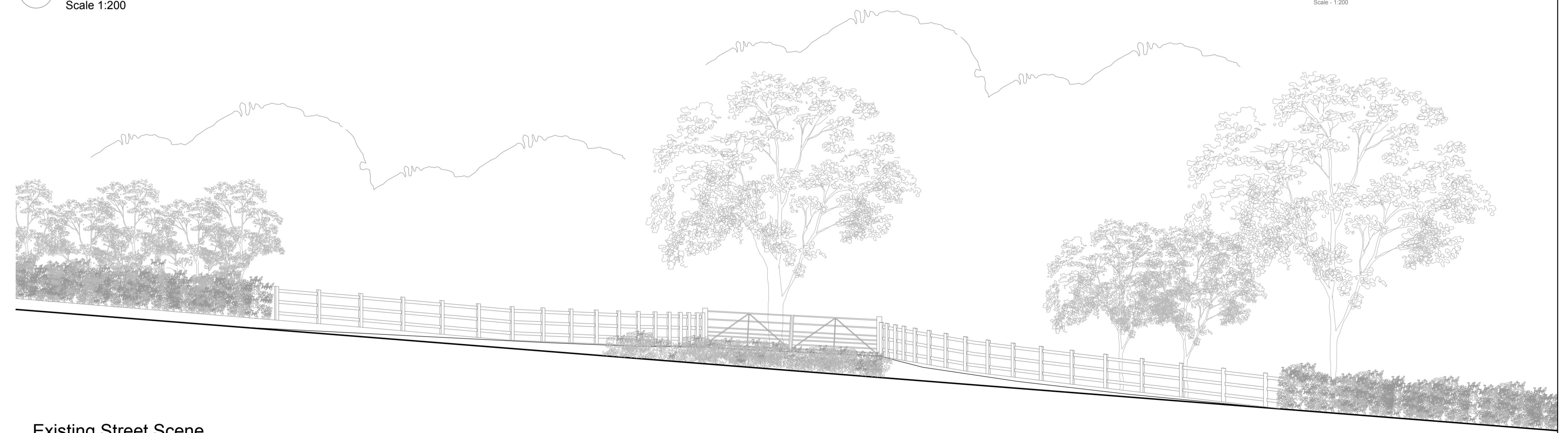
Existing Street Scene Scale 1:200