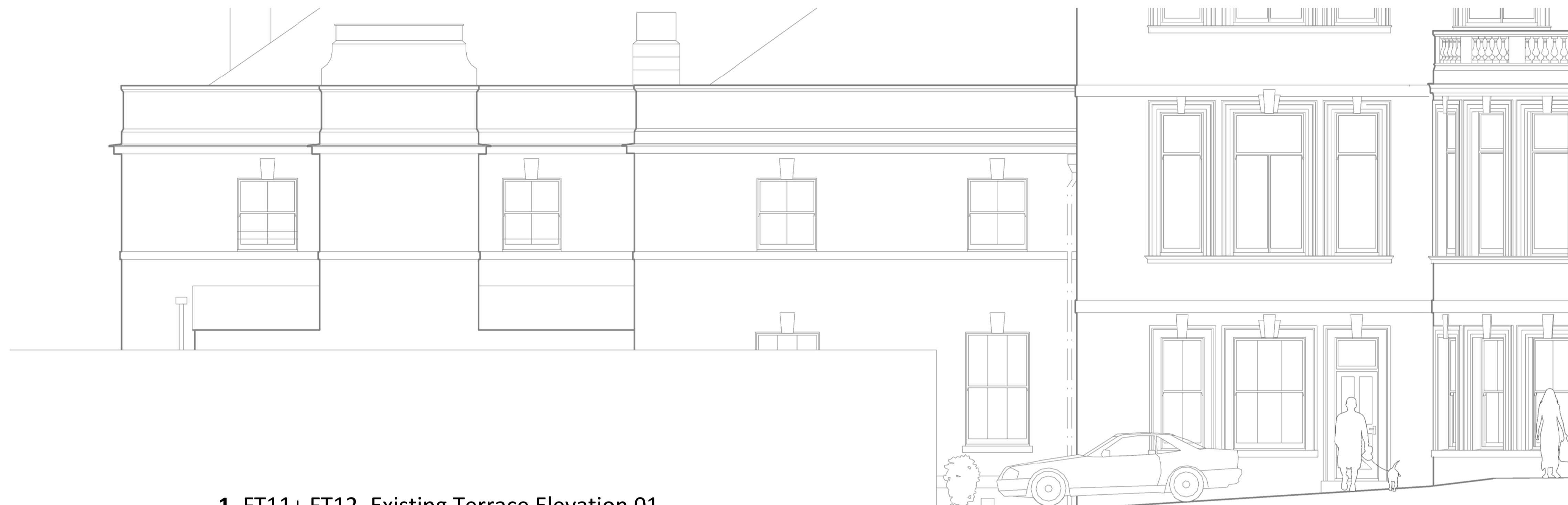
1 FT11+ FT12_Existing Terrace Elevation 01 1 : 50

Following pre-application consultations with the LPA, works to remove and replace recently added fittings and partitions where these do not impact the existing listed structure are not considered to require Listed Building Consent