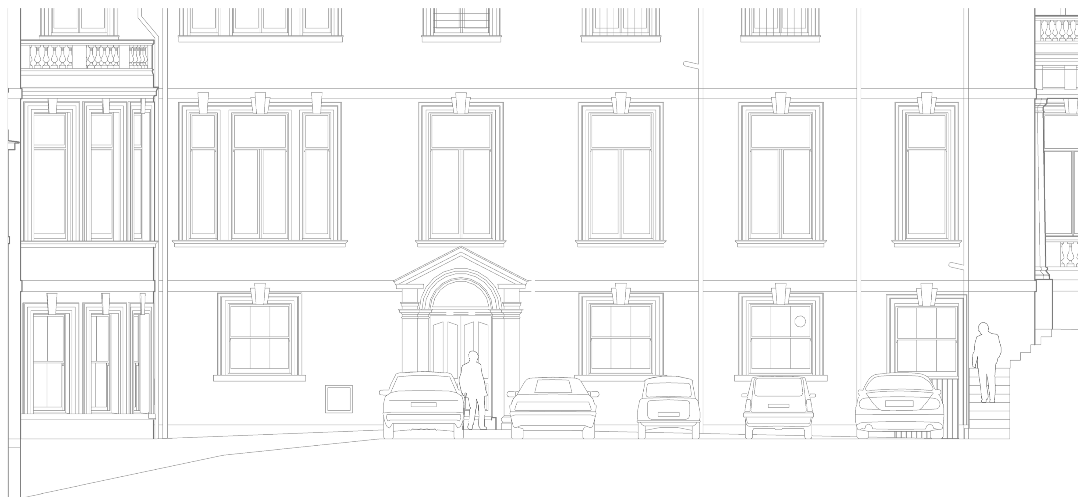
2 FT11+ FT12_Existing Terrace Elevation 02 1 : 50

NOTES CONSULTANTS - Refer to highways consultant's drawings for details - Refer to landscape consultant's drawings for details - Landscaping layout is indicative only AREAS - Refer to area schedule © Copyright Reserved. ColladoCollins Architects Ltd