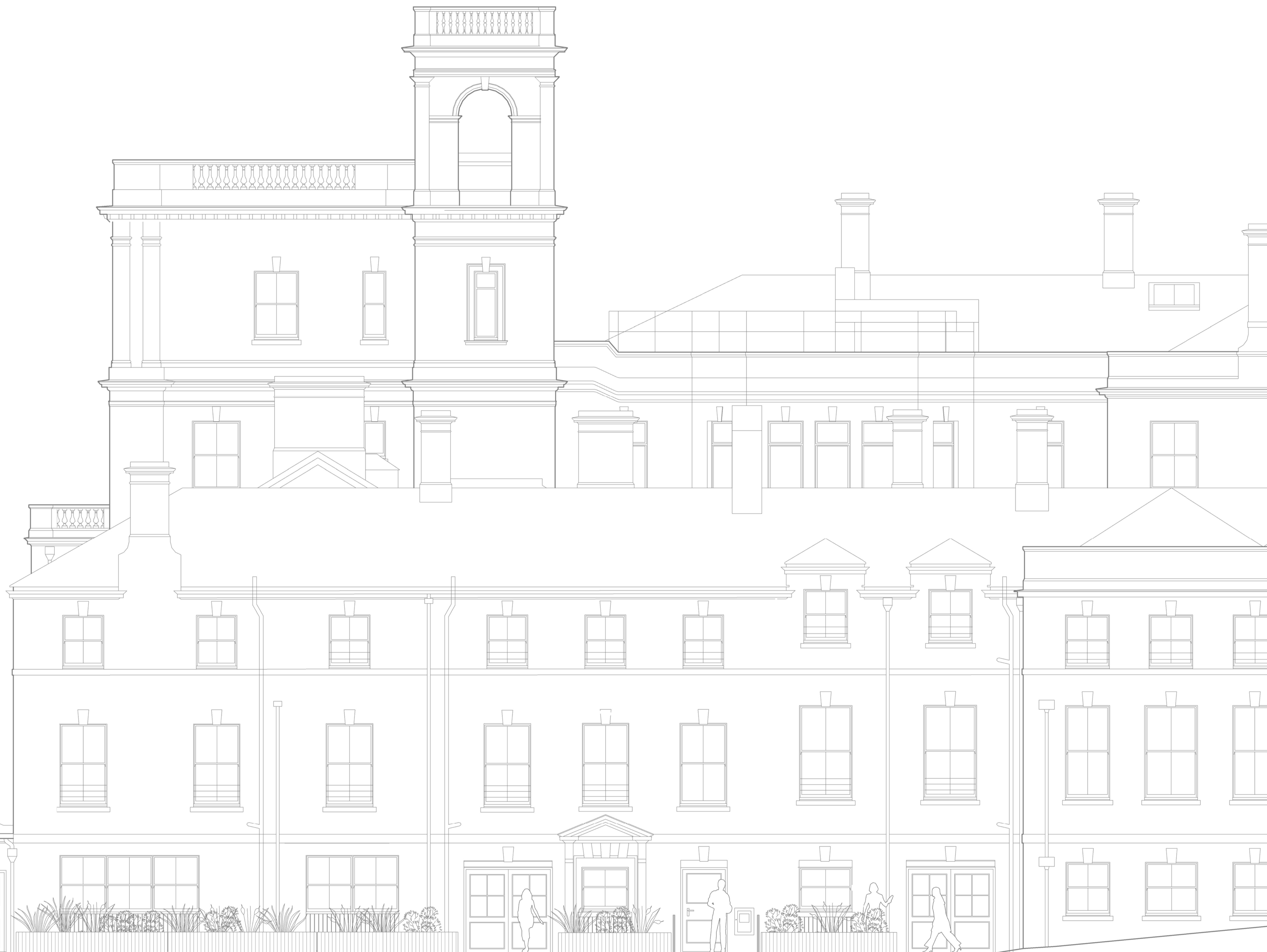
1 FT09+ FT10_Proposed Terrace Elevation

Following pre-application consultations with the LPA, works to remove and replace recently added fittings and partitions where these do not impact the existing listed structure are not considered to require Listed Building Consent