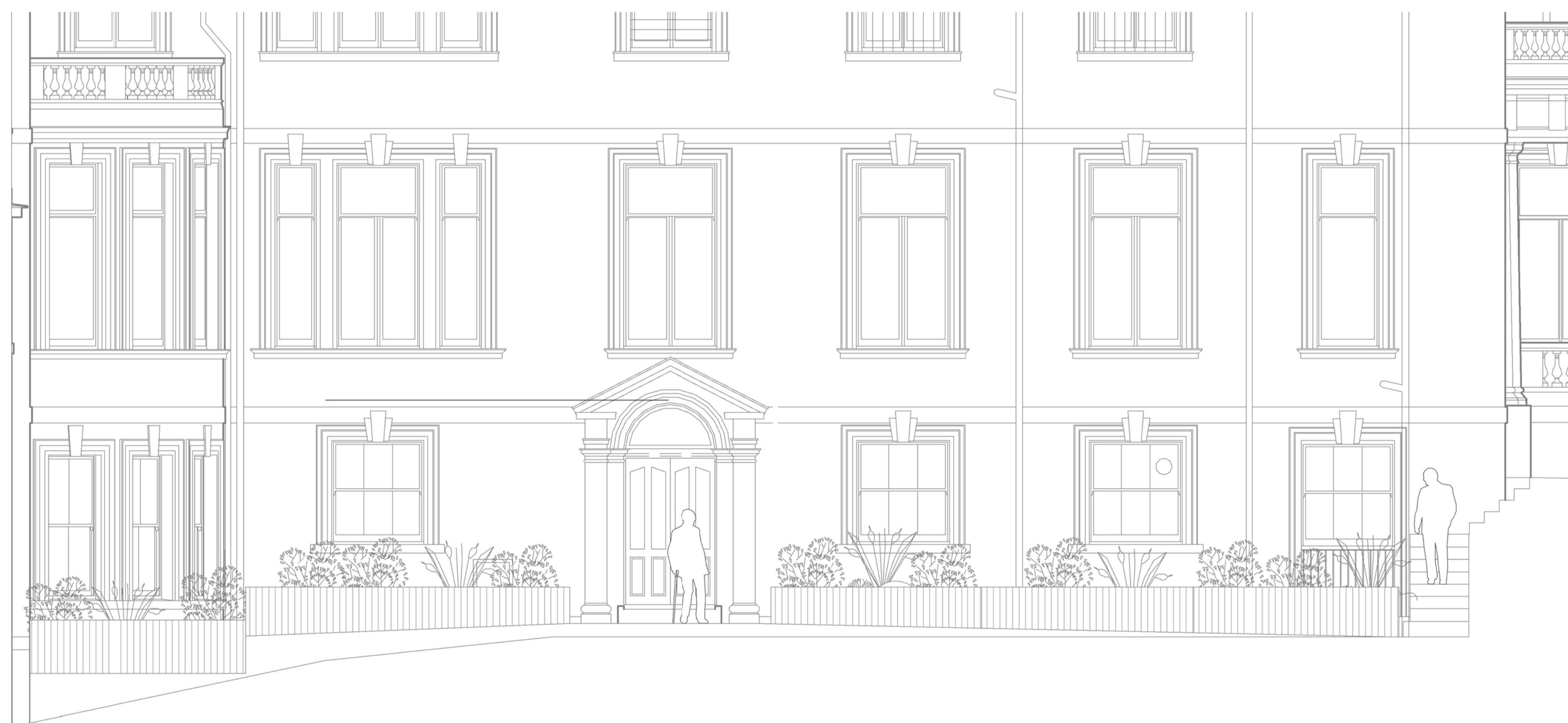
2 FT11+ FT12_Proposed Terrace Elevation 02 1 : 50

NOTES CONSULTANTS - Refer to highways consultant's drawings for details - Refer to landscape consultant's drawings for details - Landscaping layout is indicative only AREAS - Refer to area schedule © Copyright Reserved. ColladoCollins Architects Ltd