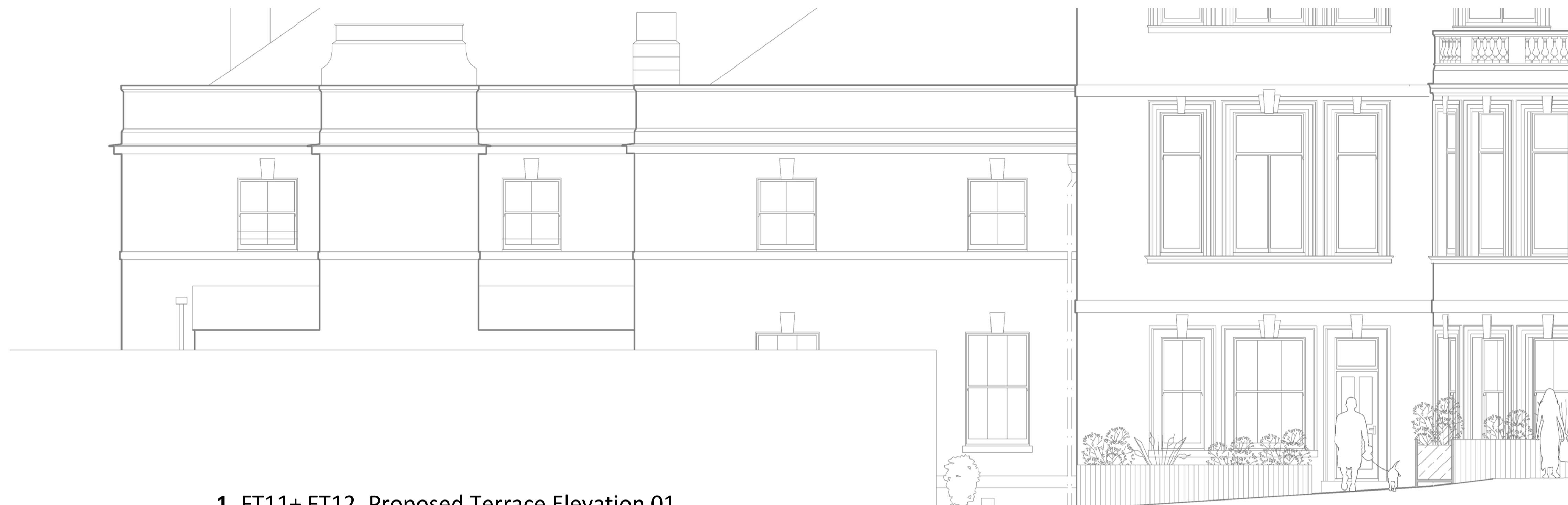
1 FT11+ FT12_Proposed Terrace Elevation 01 1 : 50

Following pre-application consultations with the LPA, works to remove and replace recently added fittings and partitions where these do not impact the existing listed structure are not considered to require Listed Building Consent