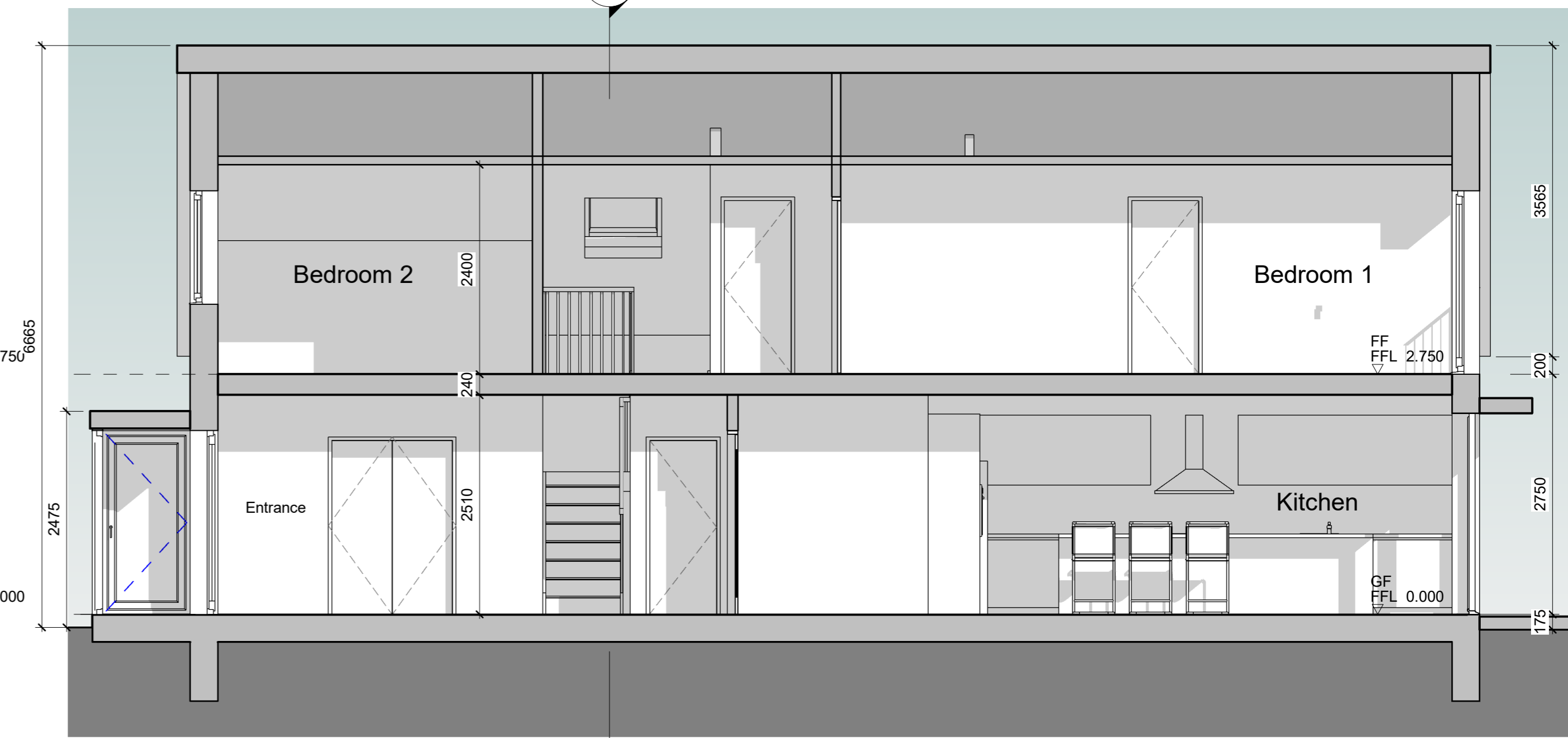
4 SECTION B PROPOSED 1 : 50