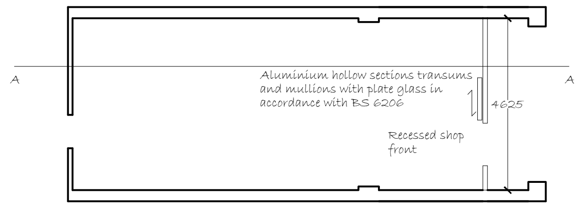
Existing Ground Floor Plan

Do not scale from the drawings. Builder to take precise measurements on site prior to the ordering of any materials. Any anomalies to be discussed with the agent and or the local authority before works commence on site. Builder is working at their own risk until the plans have been approved