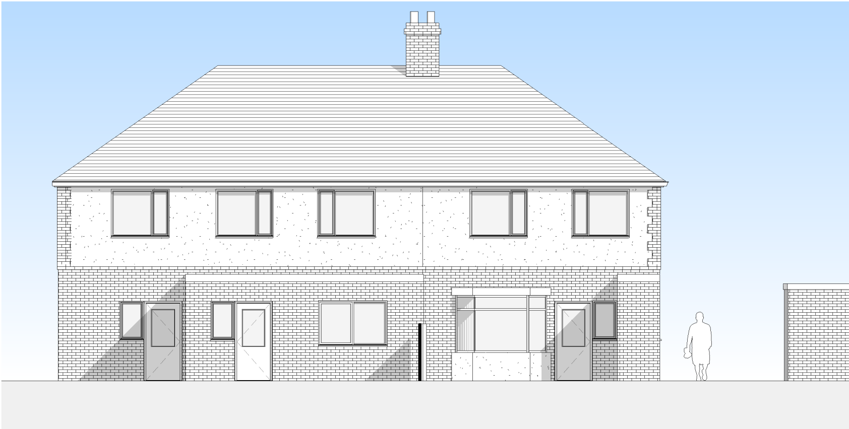
P-004 - EXISTING REAR ELEVATION 1 : 100