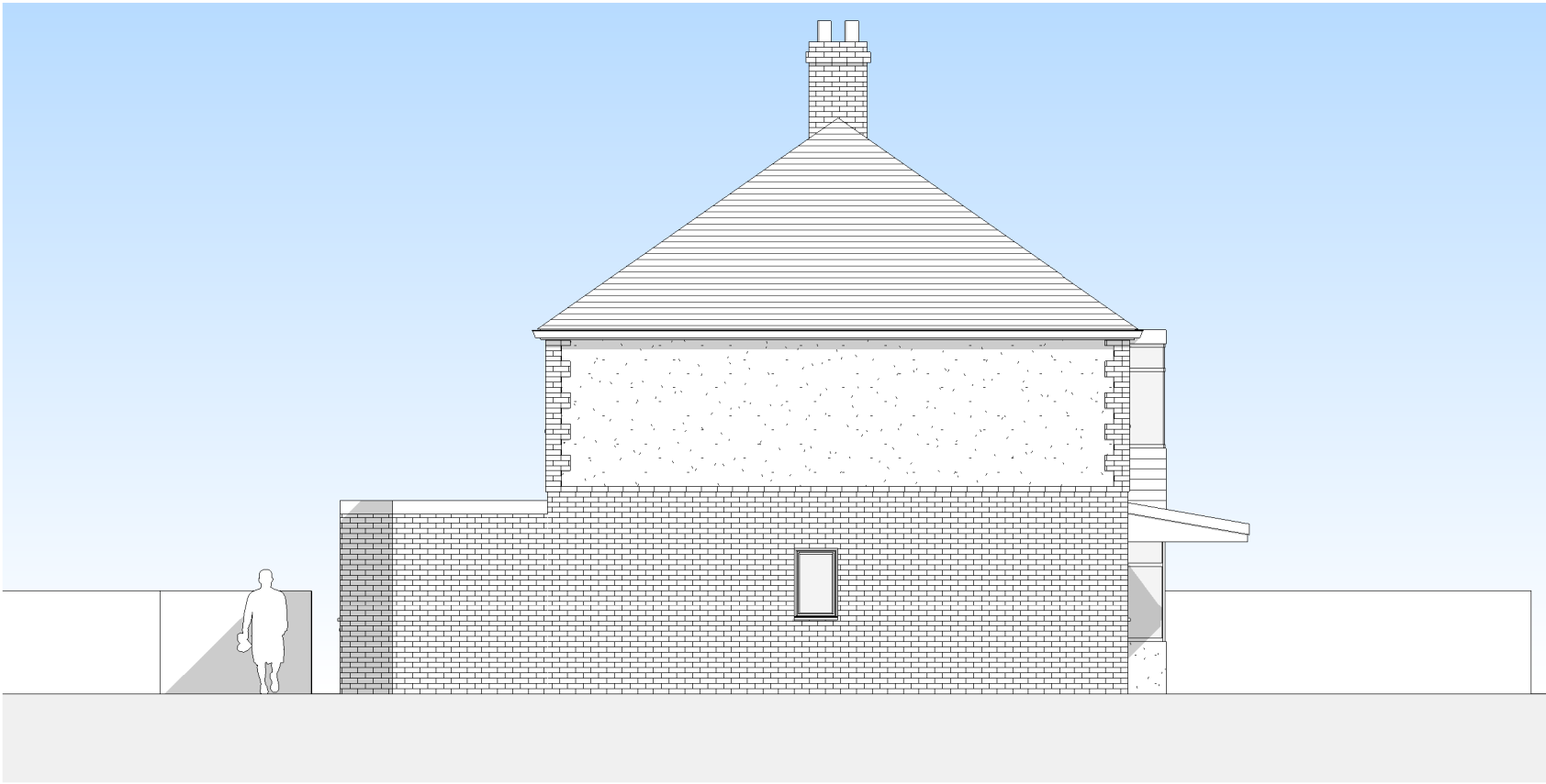
P-004 - EXISTING SIDE ELEVATION 1 : 100