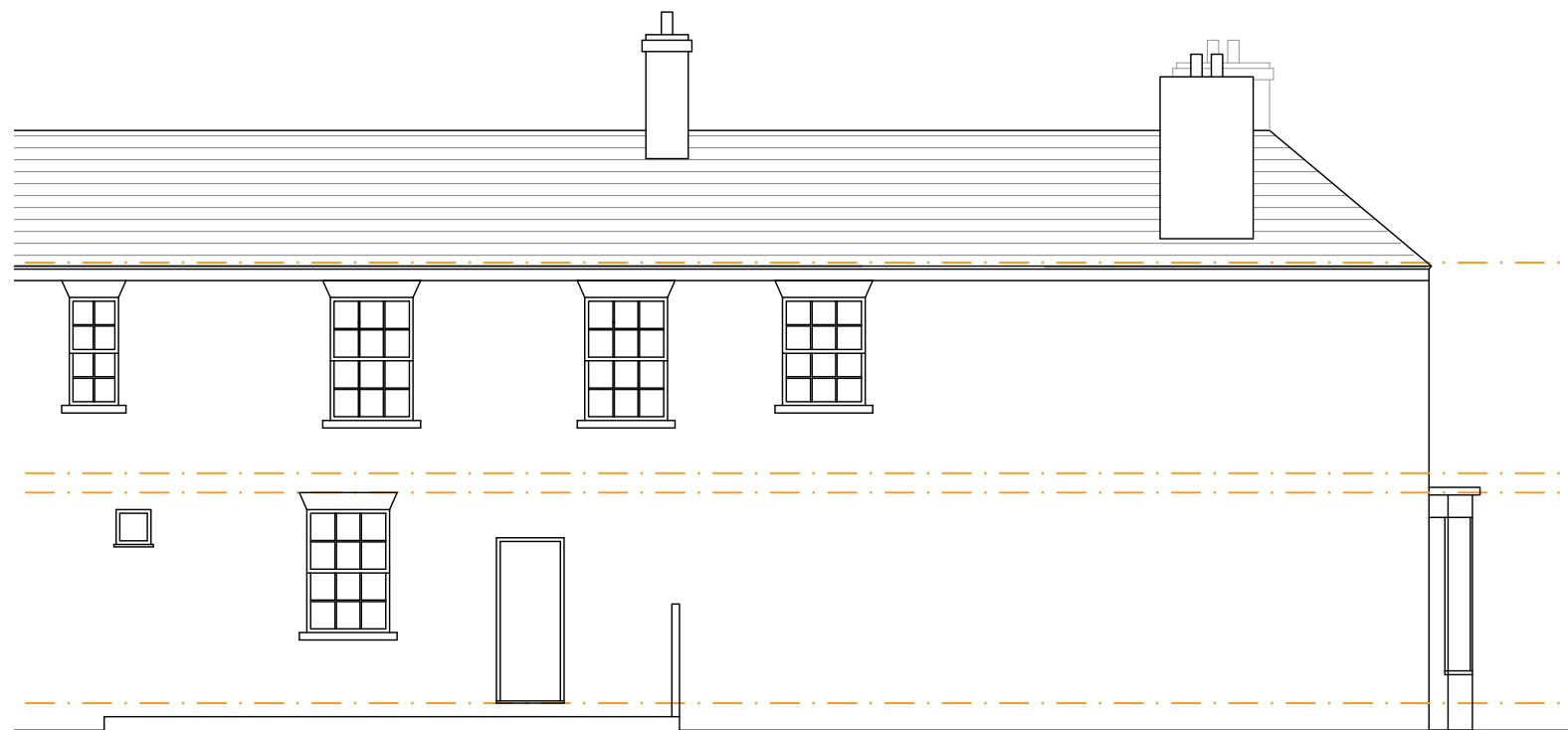
SIDE ELEVATION (West)