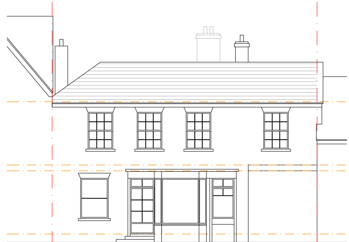
FRONT ELEVATION (South)