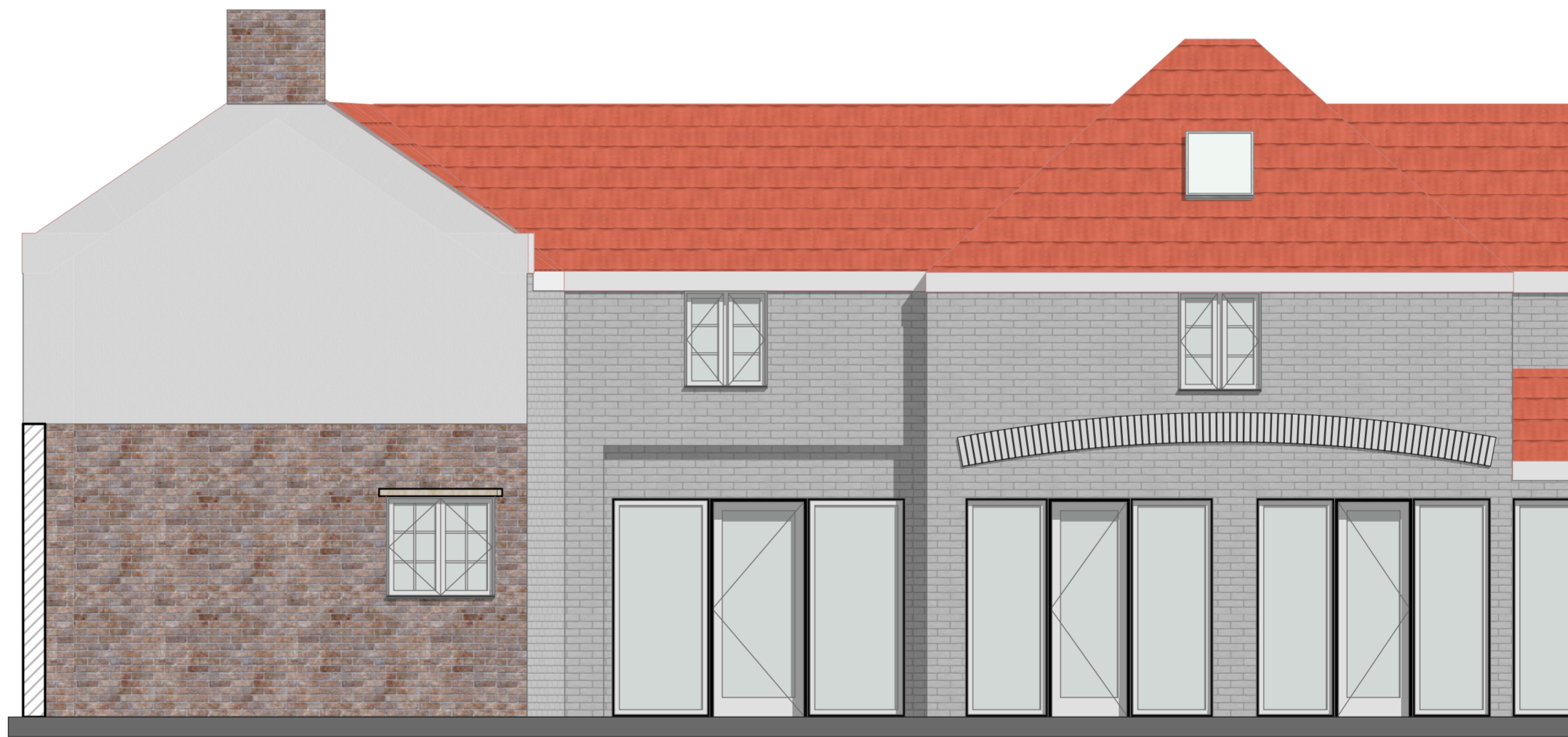
E-02 Existing Front Elevation 1:50