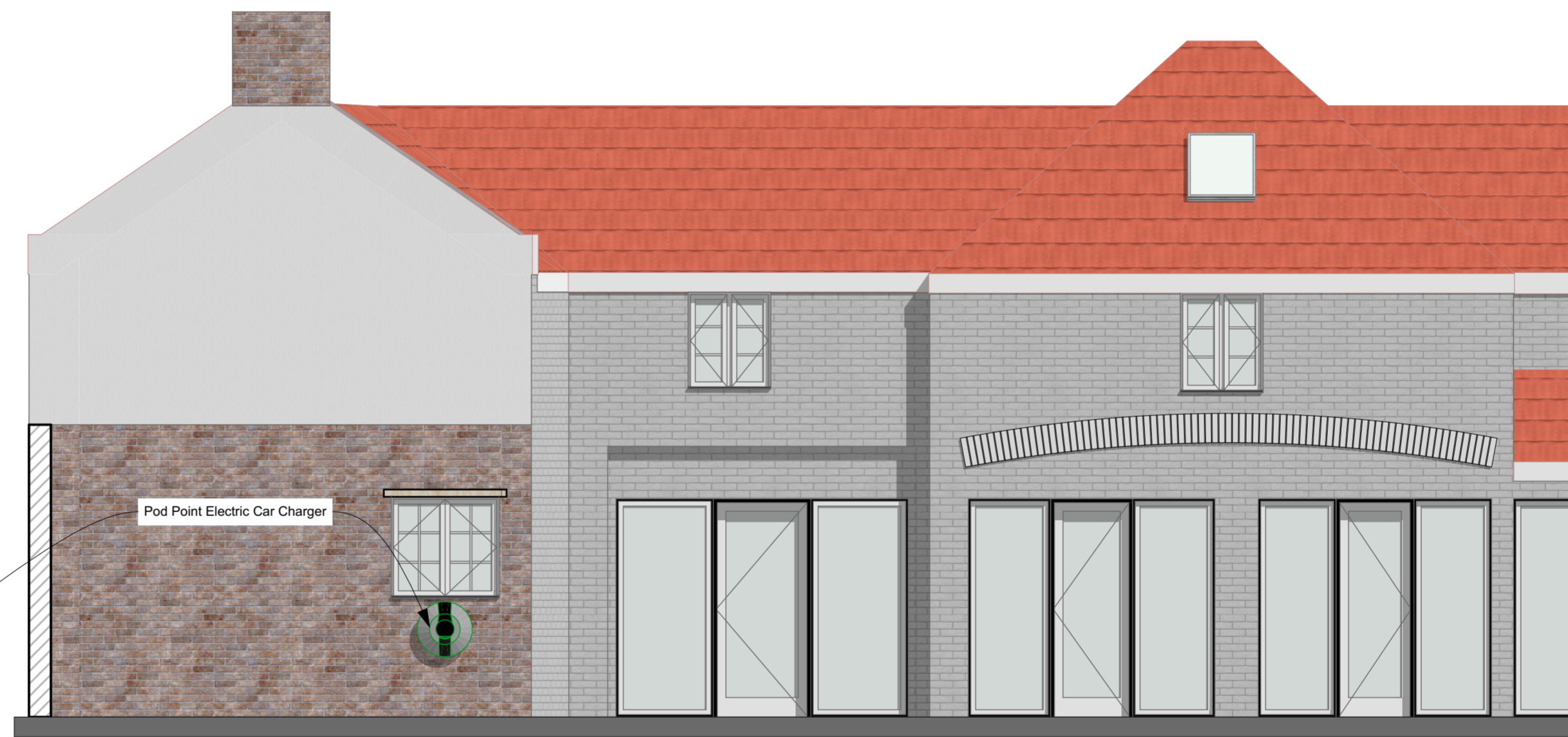
E-02 Proposed Front Elevation 1:50