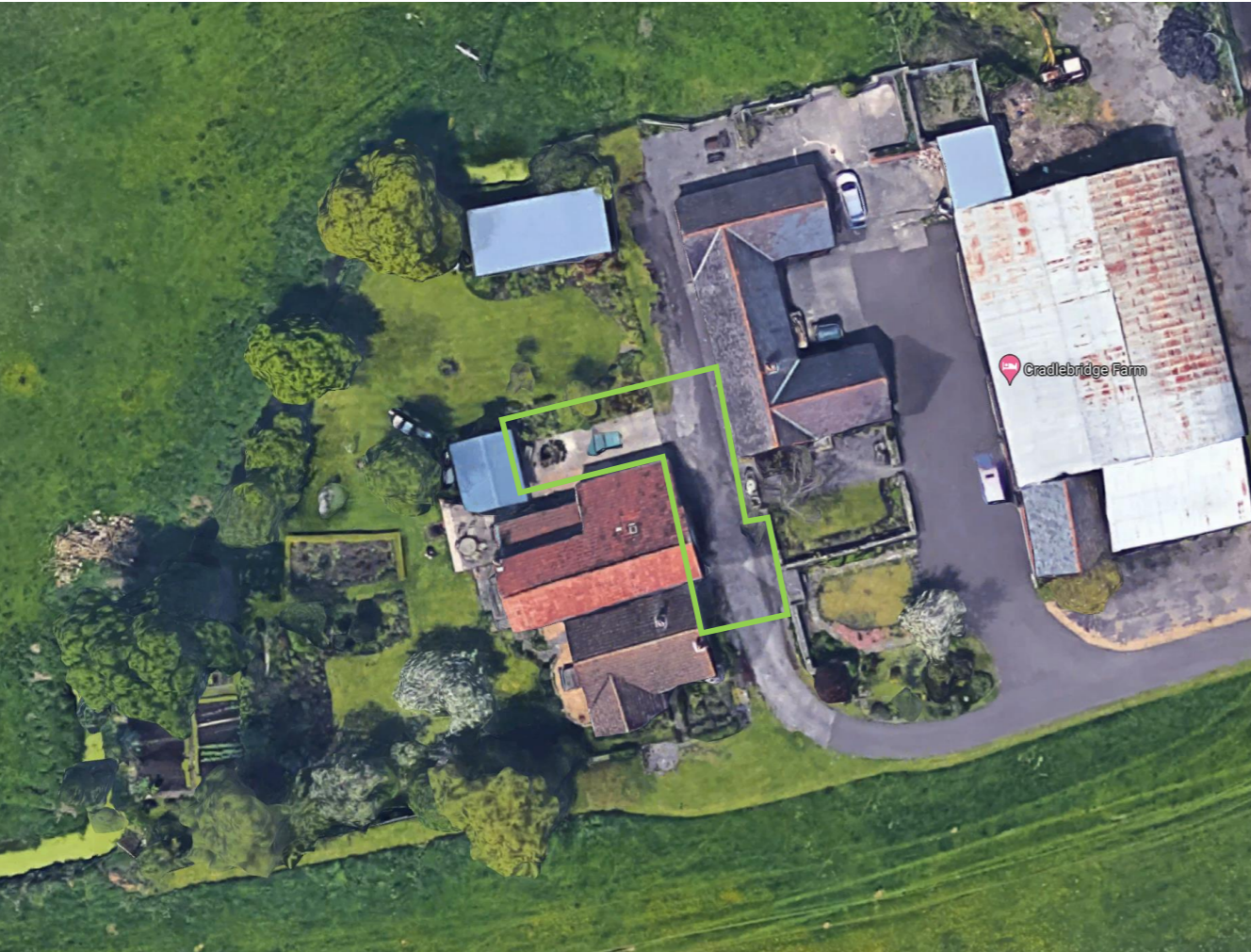
Aerial photograph demonstrating area of lawn (green outline) proposed to replace tarmac track and concrete hardstanding.

The roof area of the proposed dwelling is also much reduced compared to existing.