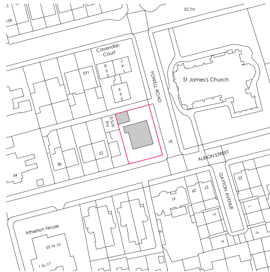
Location Plan scale 1:1250

ASBESTOS PROPERTIES BUILT PRIOR TO 2000 SHOULD HAVE AN ASBESTOS SURVEY DONE PRIOR TO ANY WORK START ON SITE, IF REQUIRED.