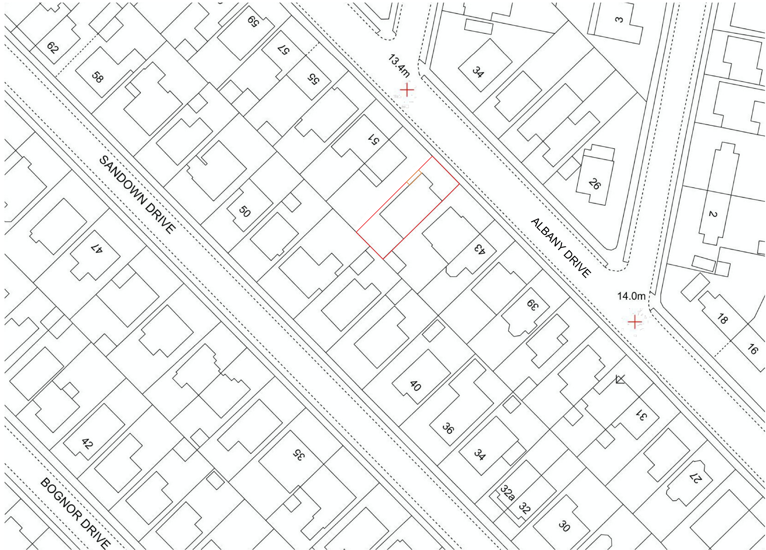
Proposed Block Plan