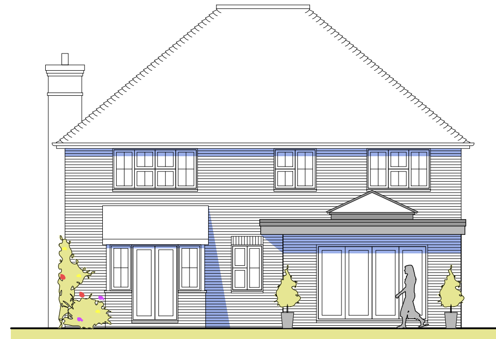
rear - west