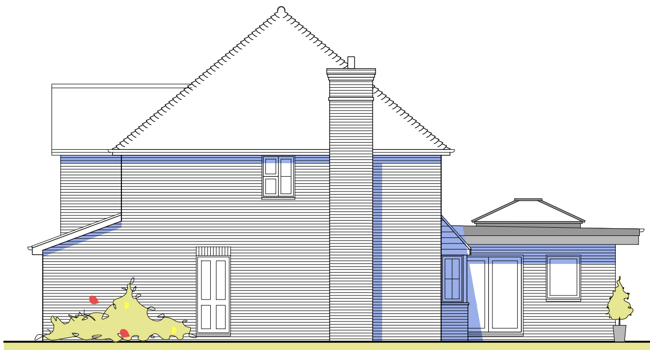
side - north