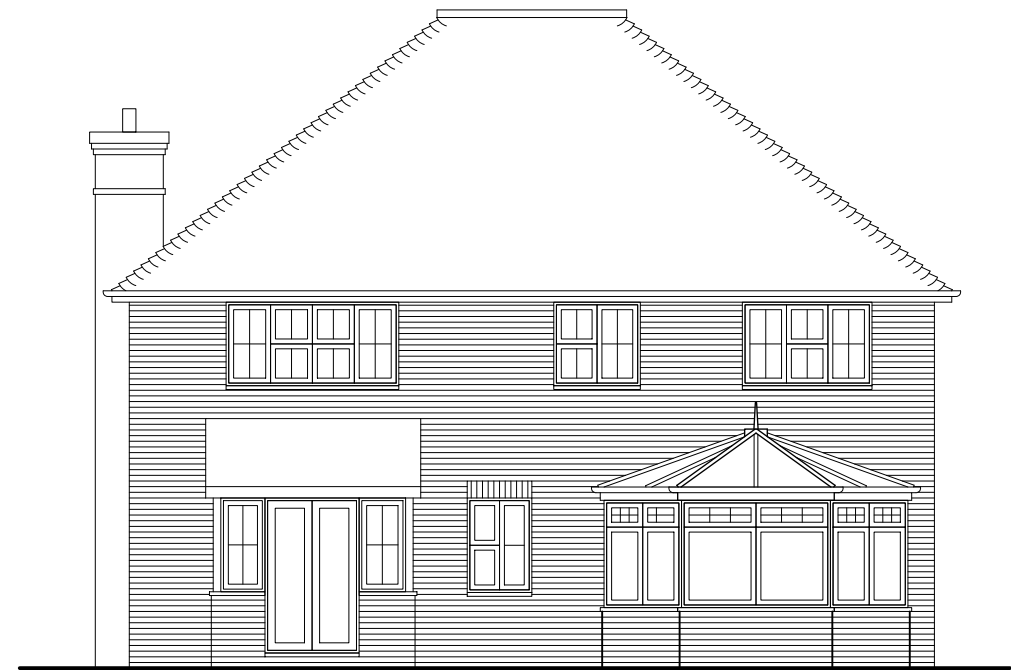
rear - west