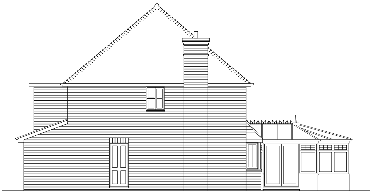
side - north