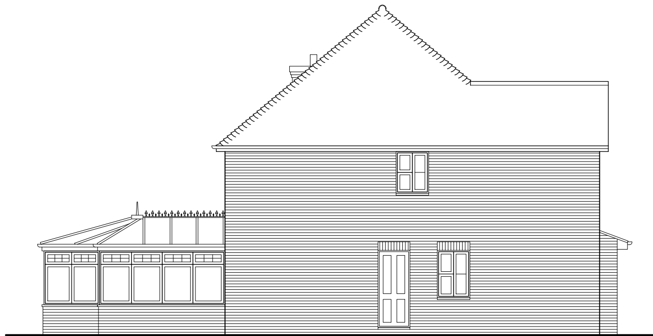
side - south